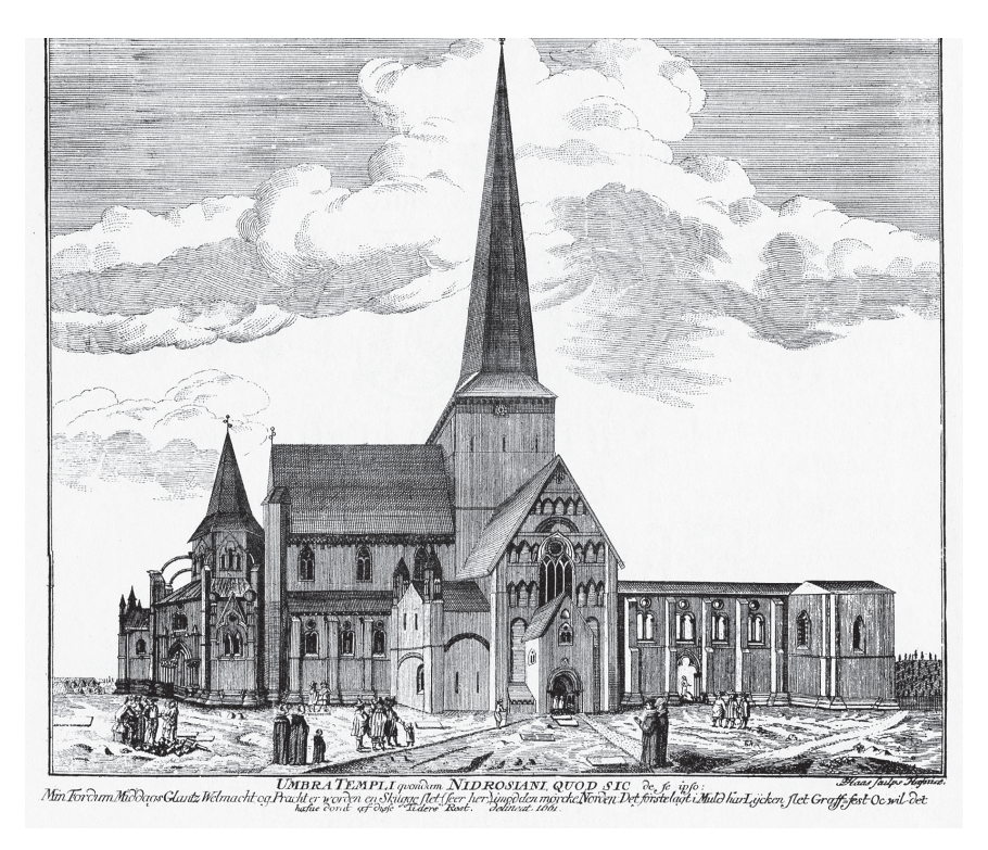
Drawing of the cathedral of Trondheim as Schøning saw it. The large western front is missing, and parts of the nave are partly in ruins. Gerhard Schøning, Beskrivelse over Dom-Kirken i Trondheim (1762).

ian and historical topics as well as matters of geography and economy. For the authors of these texts, usually civil servants (clergymen, judges, military officers, etc.) writing about their own district, Schøning's works were important sources of information, and his opinion counted as the final judgment in antiquarian as well as historical questions.<sup>9</sup>