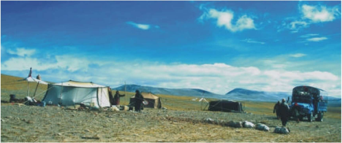
Fig. 3. Nomad camp in the Aru basin, with a recently purchased truck used for moving camp and transporting wool to market.