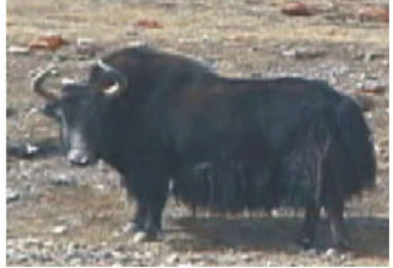
Fig. 2. Chiru (Tibetan antelope) and wild yak in the Aru basin.

Some 30 000 nomadic pastoralists depend on rangelands within the reserve for livestock grazing, and those in areas with significant wildlife density have traditionally depended in part on hunting for supplementary subsistence and trade (in part for shahtoosh). With rapid changes in wildlife markets, government subsidised modernisation of pastoralism, and concerns over preserving Tibet's wildlife populations, the establishment of the nature preserve has brought into sharp focus conflicting aspects of these various factors. The TAR's 1997 request for assistance focussed on development aid associated with the creation of the reserve; our project aims to provide baseline information upon which management of wildlife and livestock can be developed to ensure the continued presence of threatened wildlife as well as a better standard of living for nomads in the reserve.