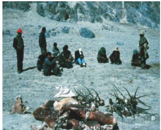
Fig. 5. Confiscation of antelope traps from a nomad (left) and chiru pelts and horns confiscated from traders (right) who bought them from nomads, both just SE of the Aru basin.