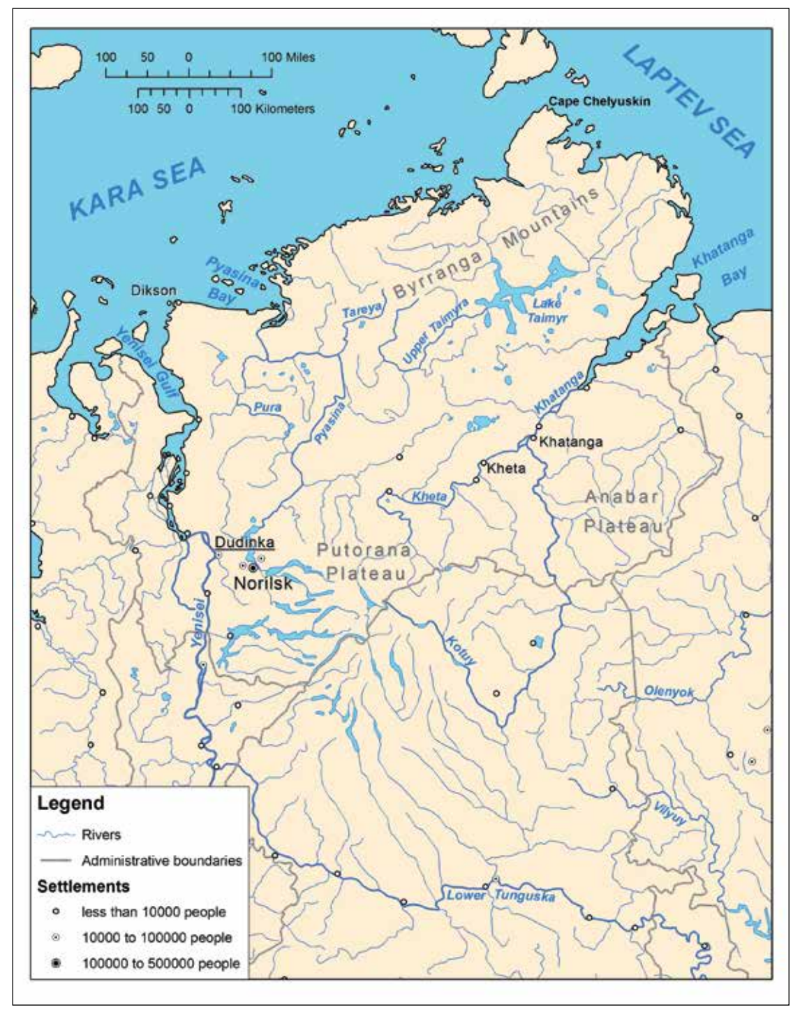
Fig. 1. Taimyr region.