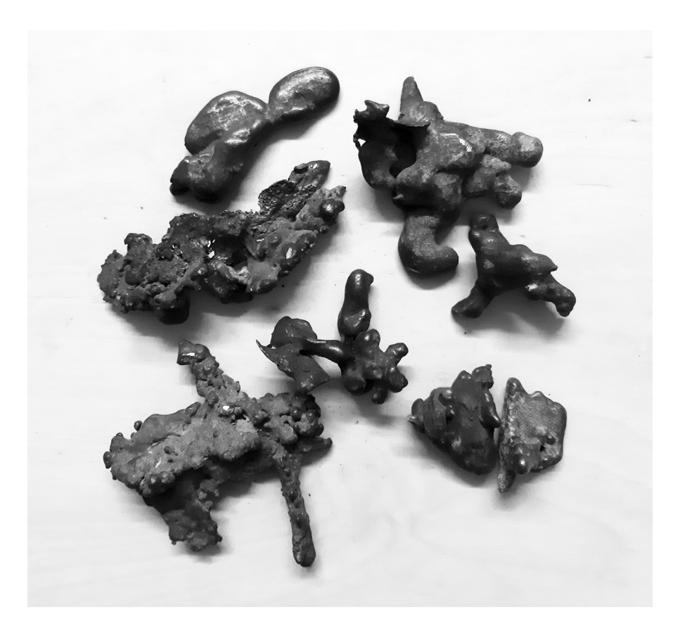
Fig. 1. The artefact collections at the Academy of Turku were almost entirely destroyed in the city fire of Turku in 1827. Fire-damaged and molten hinges and clasps from cupboards, where some of the collections were kept. Collections of Coin Cabinet in The National Museum of Finland, photograph by L. Kunnas-Pusa.

The source material for this article includes academic theses published at the Academy of Turku ( Kungliga Akademien i Åbo, Turun kuninkaallinen akatemia ), founded in 1640, and articles in Finnish newspapers during the years 1700–1828. When Finland became a Grand Duchy of the Russian Empire in 1809, the academy was renamed the Imperial Academy and then moved from Turku to Helsinki in 1828 (Fig. 1).<sup>8</sup>