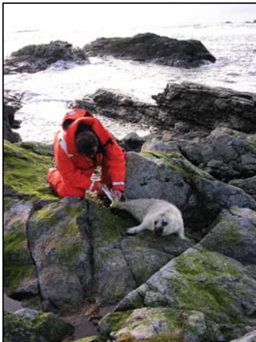
Fig. 2. Grey seal pups were tagged to prevent double-counting on subsequent surveys.

All known and potential grey seal pupping areas in Troms county were surveyed on 10 and 17-18 November 2003.