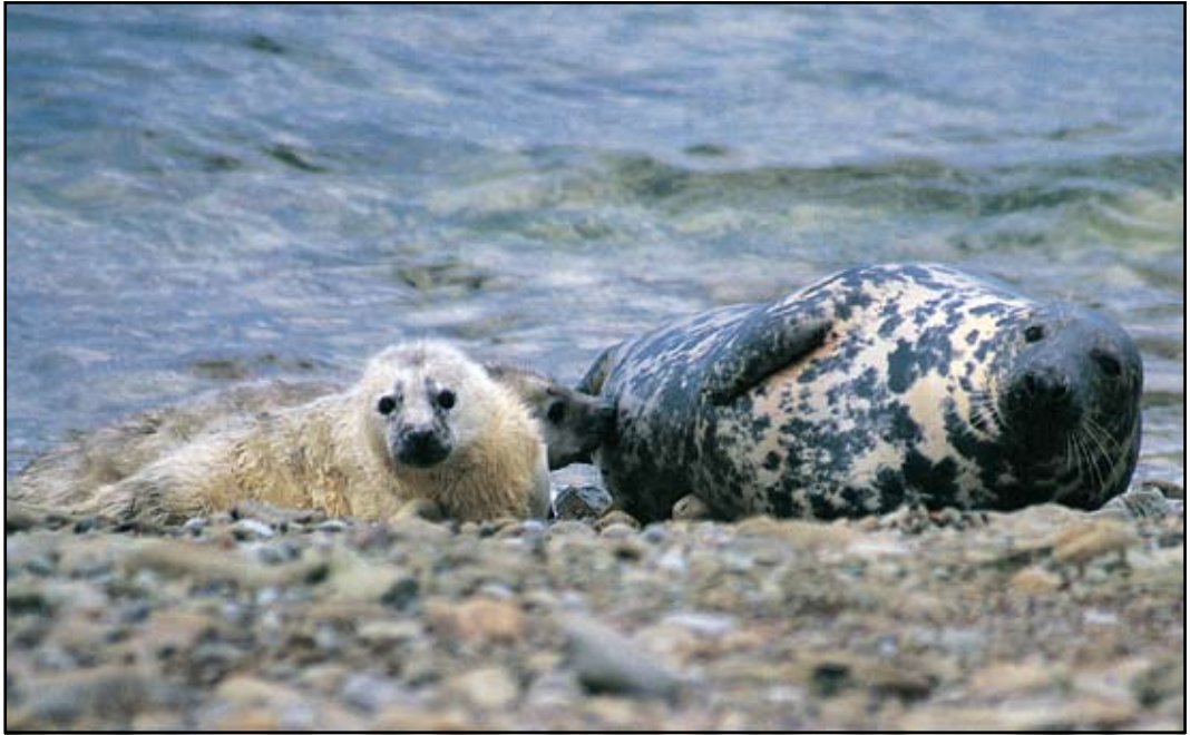
Fig. 1. A grey seal nursing her pup.