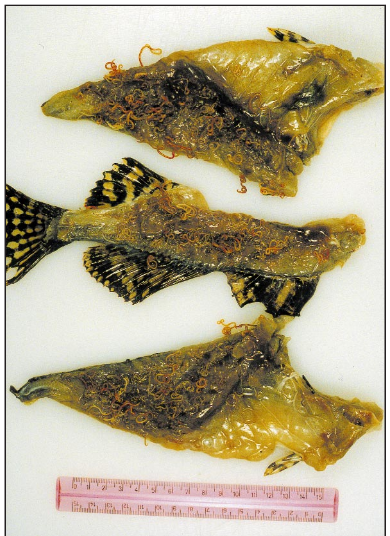
Fig. 3. The trouble with sealworms... Heavily infected bull rout from Hvalseyjar, west Iceland.

Hauksson 1997). Seasonal and regional variations in sealworm abundance observed in the latter surveys, were similar and discussion below will refer to the 1989-1993 survey. Sealworms were found in grey seals from all seasons and study areas and young seals seemed to become infected once they begin to feed independently (Table 5). The lowest abundance was found in seals from the south coast from January to August. The largest regional difference was, however, observed during the breeding season in autumn. On the south coast, the abundance increased from summer to September but declined rapidly, as expected, after the breeding began in October (Table 5). On the west coast, on the other hand, the sealworm abundance increased greatly during the breeding season in autumn and no decline was ob-