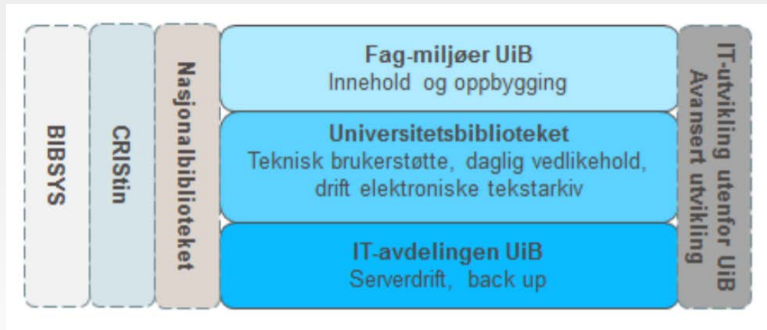
Figure of the general model, from Sluttrapport for prosjektet Digitale Fulltekstarkiv ved Universitetsbiblioteket i Bergen, 2014 .