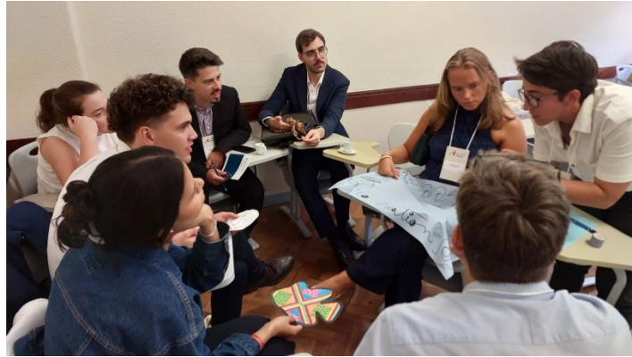
Figure 4 Groupwork on co-creation.