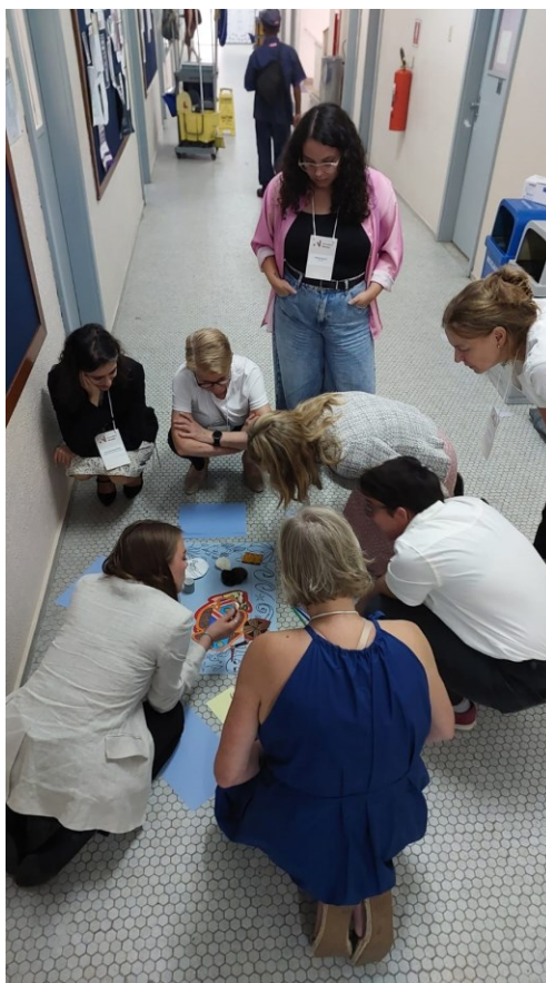
Figure 6 Groupwork on transdisciplinarity