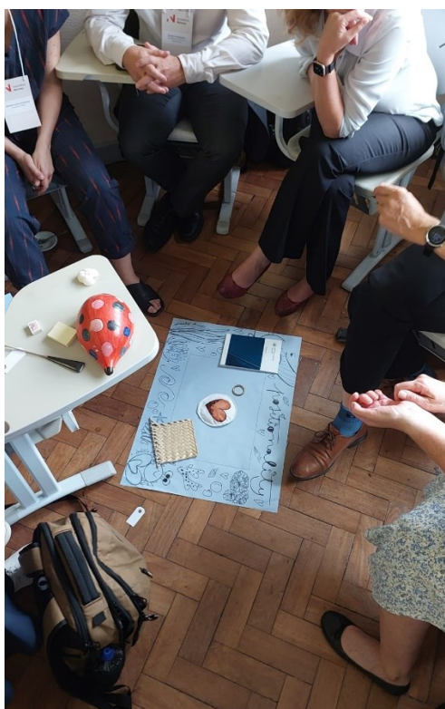
Figure 3 Groupwork on Positionality.