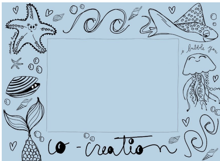
Figure 10 The cover of co-creation developed for the Ocean Incubator Network Project and adopted during the first two workshops. Illustration: Valentina Russo