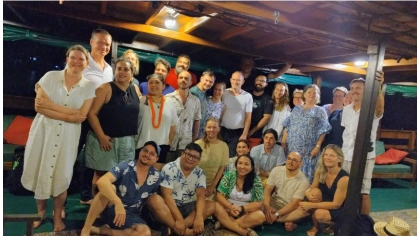
Figure 9 Boat seminar group.