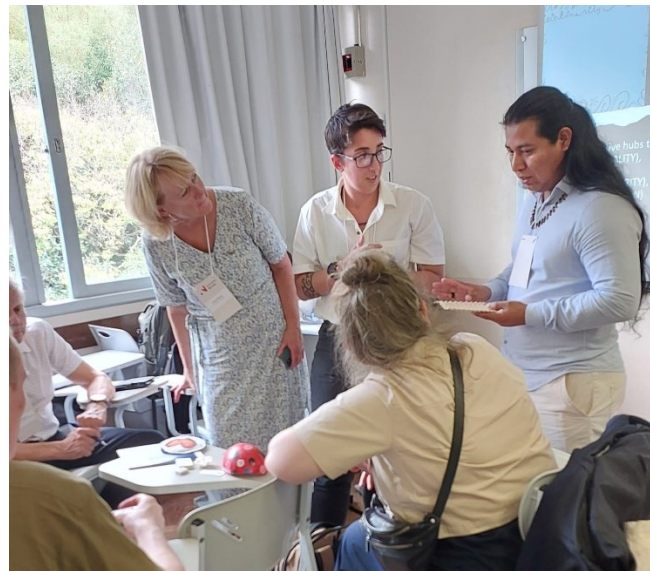
Figure 1 Indigenous knowledge for a sustainable and just Planet.

https://doi.org/7557/7.7858 Poto et al: The ECO_CARE Participation in the G20 Delegation to Brazil. Septentrio Reports 1 (2024).