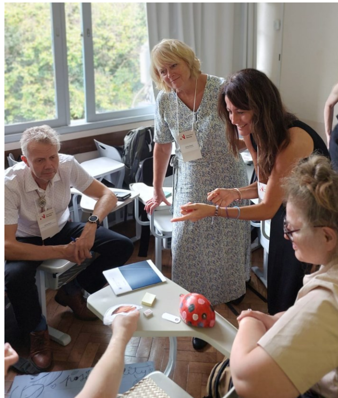
Figure 5 Brainstorming with researchers and participants.