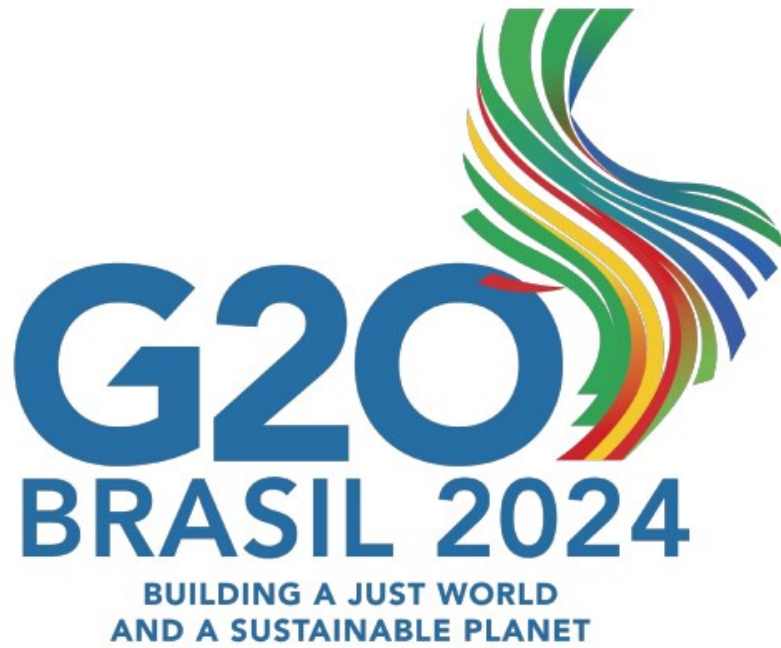
Figure 2 The Logo of G20