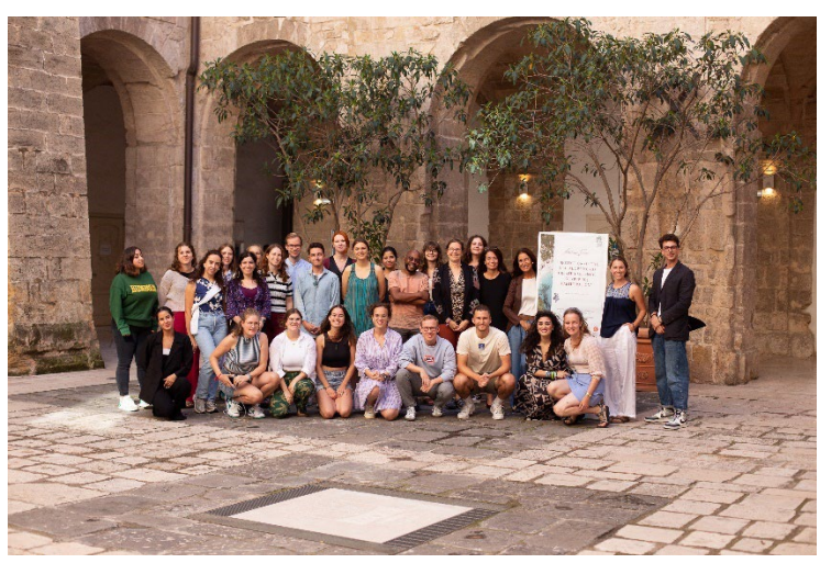
Figure 1 The Autumn School participants at the University of Bari – Sede di Taranto.