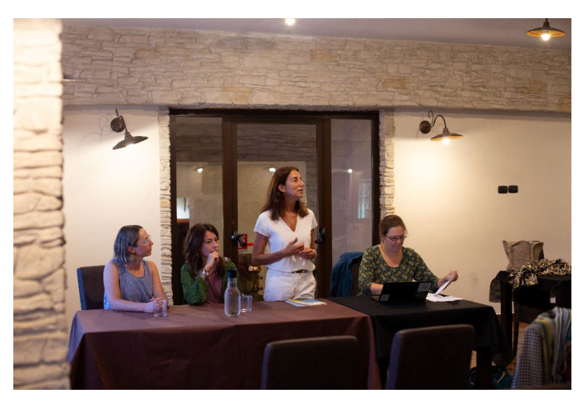
Figure 6 The Project organizers welcoming the participants.