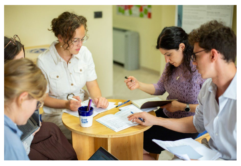
Figure 9 Group work at the Community Hub.