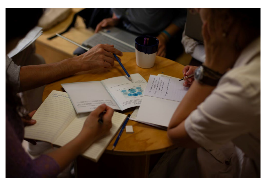
Figure 8 Group work and reporting.

In the afternoon, participants gathered in the Community Lab at the University of Bari – Sede di Taranto to start brainstorming and developing their group projects. The day concluded with a sharing of preliminary results and collection of feedback.