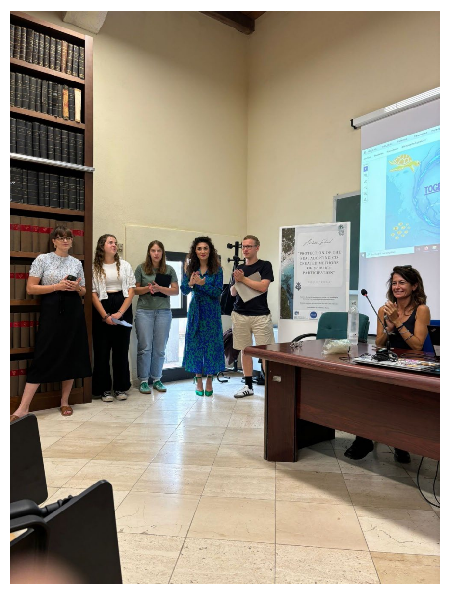
Figure 11 Final presentations.

Justice, and Strong Institutions). This culminating event underscored the co-creative spirit of the workshop, emphasizing mutual care for each other and for the ocean.