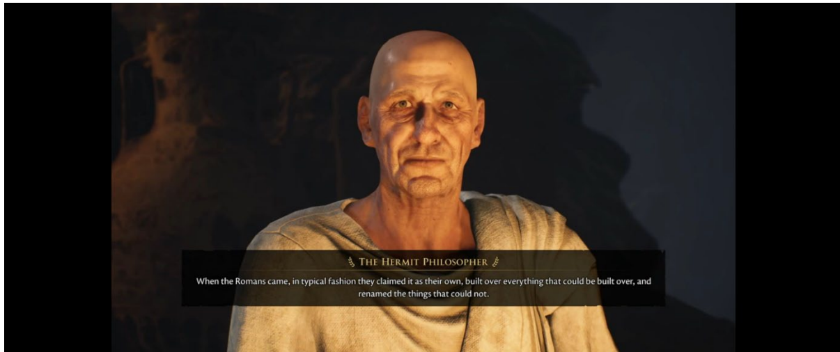
Figure 3: Talking to the Hermit Philosopher in The Forgotten City .