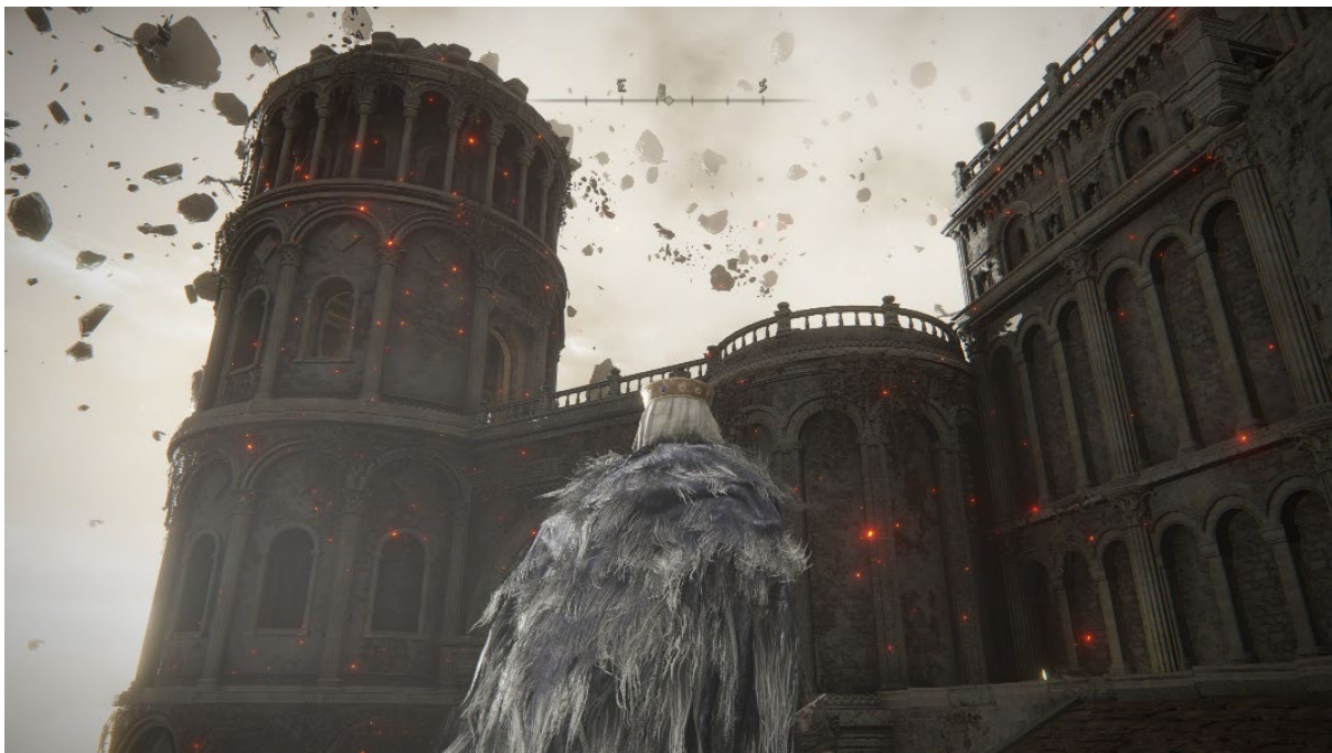
Figure 4: Gothic architecture in Crumbling Farum Azula, Elden Ring .