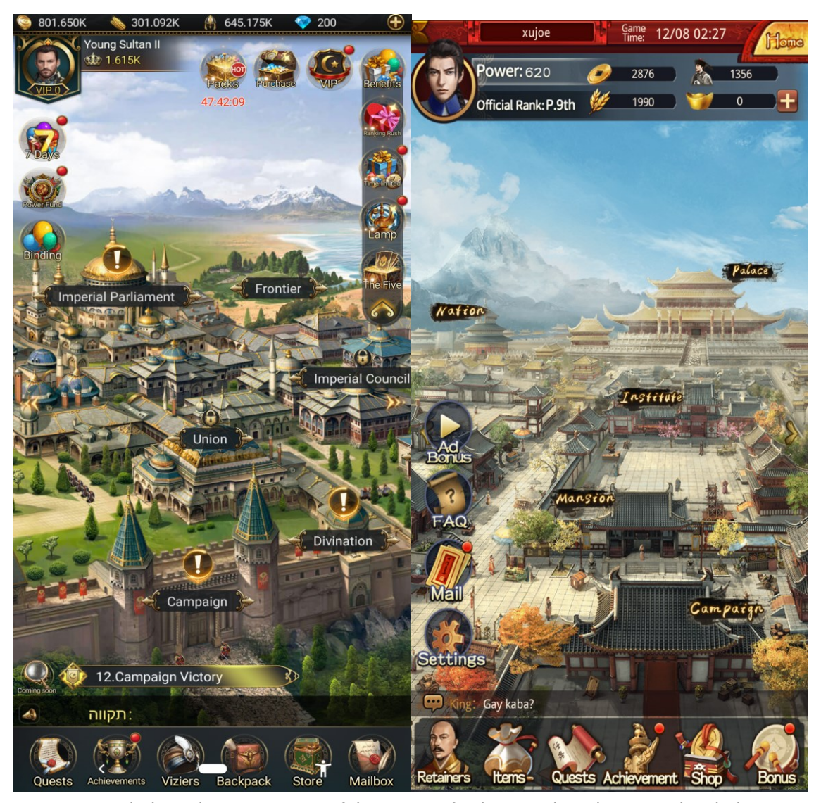
Figure 2. Side-by-side comparison of the Game of Sultans and Be the King , a local Chinese palace game.

On the surface, a reskinned version of a game simply replaces the Chinese Forbidden City with the Ottoman imperial serail, the court advisor with the royal vizier, and the concubine with the consort (Figure 2). This ease of adaptability of palace games highlights how tales of courtly romance and heroic quests are already endemic parts of popular culture writ large. Much of the art, dialogue, and storylines in palace games are intentionally borrowed from popular palace dramas that dominate the Chinese media landscape. Palace dramas function as a form of prestige television, incorporating huge casts, massive set pieces, and elaborate costumes. Zhu (2008) argues that the proliferation of these dynastic palace dramas represents a sort of "authoritarian nostalgia" leveraged by the Chinese government in promoting Confucian Neo-conservatism as an alternative to Marxism and Western liberalism (p. 32). The Chinese state actively employs revisionist histories to bolster its political legitimacy by harkening back to glories of former empire. Similar dynamics apply to reskinned palace games that take place outside of the Chinese cultural context. One