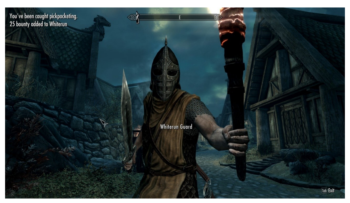
Figure 3. Getting caught and bounty increase in Skyrim (Bethesda Game Studios, 2011).

fine depending on their bounty or bribe the guards, otherwise they will be imprisoned. In the case of imprisonment, the players lose all their items, and an emergent Picaresque narrative starts. In this event, players should decide to escape from prison using lockpicks and getting back their items or serve the amount of time that has been decided, losing skill levels and money. BG3 also features this type of mechanics, by introducing an opinion and revenge system in case of stealing or killing NPCs. When the player is discovered, they engage in a dialogue that can be solved through bribing or manipulative dialogues that are improved with the deception proficiencies of the character. In case of not convincing the victim, players may end up being attacked by a group of enemies. These video games use the diegetic transgressivity, the consequences of behaving as a rogue, and the dramatic agency to increase the number of Picaresque experiences in which the player can participate.