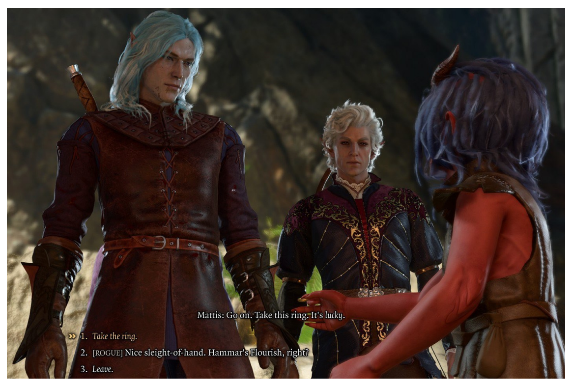
Figure 4. Start of a Picaresque experience with Mattis using a rogue avatar (Larian Studios, 2023). © Larian Studios