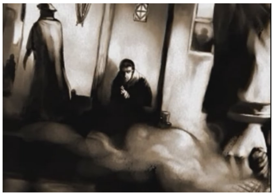
Figure 1. Garrett as a young rogue in Thief: The Dark Project (Looking Glass Studios, 1998).