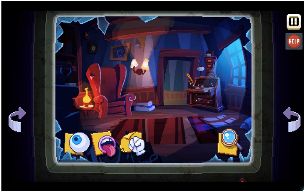
Figure 2: The front of the CRT monitor with the point-and-click adventure game.