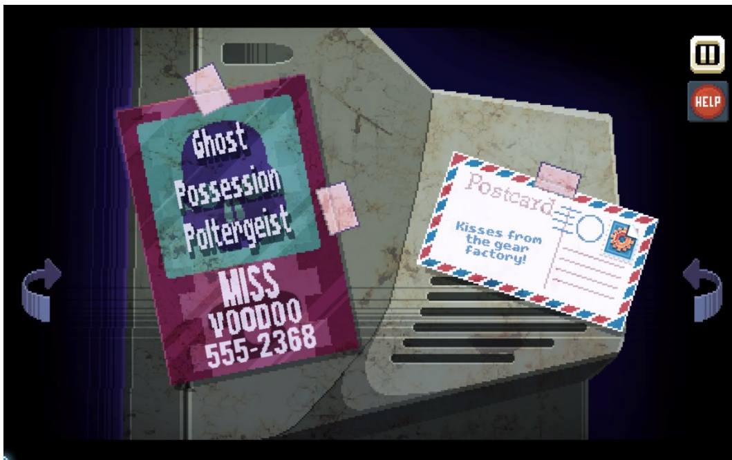
Figure 3: One of the sides of the CRT monitor.

The moment in which the player and Game are transported to this new dimension, the tone shifts and it becomes clear that the player is no longer working against Game (as they had in Jam Edition ). Although the two begin with a rather confrontational relationship, this narrative thread does not retain the same prominence that it had in There Is No Game: Jam Edition . This is reinforced by both Game's helpful comments, as well as the game's HUD, which now includes a prominent "help" button, providing players with a number of clues and hints to solve