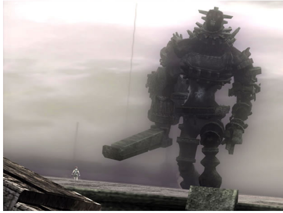
Figure 1: Cover of Shadow of the Colossus (Sony 2006)

Without focussing only on the ludological aspects, the narratives, the game design or the gameplay, I will stress a theoretical learning perspective on the process of experience within this game. Therefore I will introduce a linear and a circular understanding of learning within digital games exemplified by the action adventure “Shadow of the Colossus” (Sony 2006)