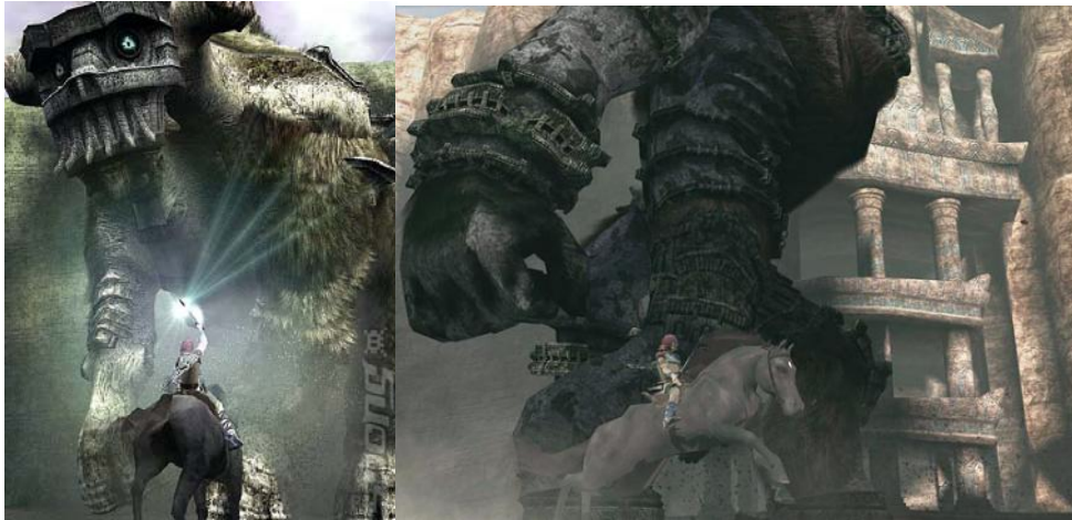
Figure 4: Invincible Enemy

The player learns how to climb onto the Colossus, how to hold onto him, while his enormous body shakes. Each step confronts the player with new unexpected movement - he tries to balance and search for ideas. He learns that he can not beat the giant, but search for his 'Achilles tendon' and after a miserable and ugly fight, he stabs his magic sword in the weak point of the Colossus. But, the victory is not at all glorious, it is rather tragic and breathtaking. It is like defeating someone innocent, who did not even offend you. Peterp states: "Killing the Colossus leads to another emotion: disappointment. There is the sight of grandeur destroyed, a feeling of being a barbarian, a sense of palpable loss that comes with each victory. Once the killing is done, there is nothing joyous about it." (Peterp, 2005) 9