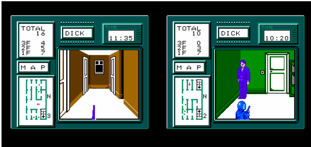
Fig. 5: Seamless alternating between First- and Third-Person viewpoint in Rescue: The Embassy Mission