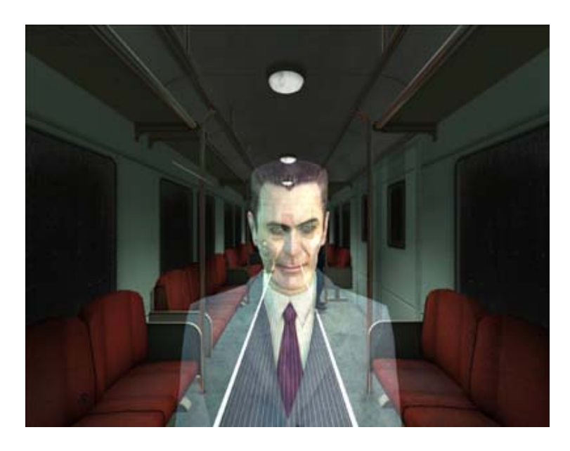
Figure 6: The apparition of the G-man in Half-Life 2

Who is this G-man? What reality does he inhabit? His ambiguous status in the Half-Life gameworld is what makes him such a compelling—and creepy—character. The innovation of an "insanity meter" in Eternal Darkness: Sanity's Requiem (Silicon Knights 2002) is another example of the incorporation of uncanniness into regular gameplay. If you failed to fully kill the monsters in the area you were in, your insanity meter would begin to turn critical, in which case certain perceptual hallucinations would occur—horrific noises would ring out, large insects appeared to crawl on the screen, and the player would return to a previous room in the game only to feel that their avatar was much smaller than before, the hallways longer, the walls more canted. Such contrivances play on a fascination towards the very fringes of reality. When we play videogames, there seems to be a latent, unconscious desire for an encounter with the ghost in the machine. What could account for this perverse fascination at the margins of gamic reality? What precedent is there for this kind of uncanny gameplay?