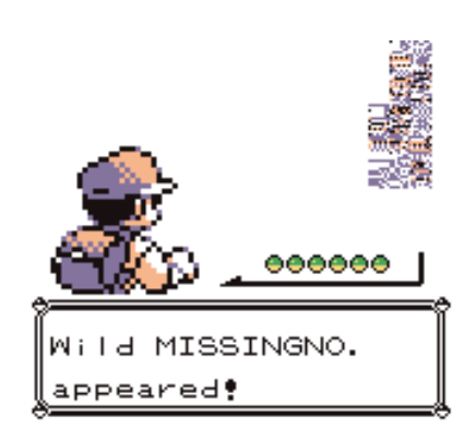
Figure 2: The purple MissingNo. glitch in Pokèmon Red and Blue<sup>21</sup>

Like MissingNo., these manifest as a stain, a blot, a Thing, a gap, a ghost or specter in the scene. They are apparitions that haunt the scene without dissolving it under their spell.