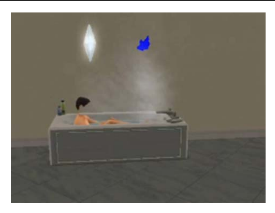
Figure 5: The 'blue-face' glitch in The SIMS

The animus, which seems to make its presence felt in such situations, is nothing less than the spirit of the machine itself, the trace of the quasi-animate registers and loops and functions within any programmed object. We know these phenomena are generated from perfectly rational (if at times complex) mechanical processes, but at the same time we admit them their destabilizing, supernatural effect. The particular manner by which this is effected, "at the basis of [the] fabrication of the uncanny" (Dolar 1991, 22), is referred to by Žižek as (the formula of) "fetishistic disavowal"; or, as it is commonly phrased, "I know very well... nevertheless I believe..." (1989, p.18), In this case, the player knows very well that he/she is only playing a game, and that the strange symptoms exhibited by the object or character onscreen are only an effect of some "bug" in the game's code, but, nevertheless, some nagging, unconscious dread is roused by this uncanny intrusion into the game's ordinary reality.