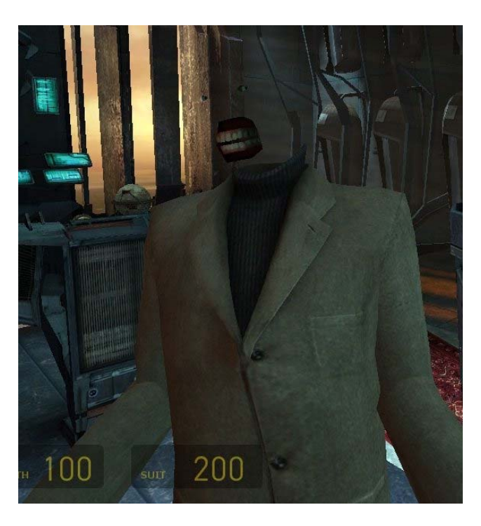
Figure 4: Half-Life 2 face glitch<sup>25</sup>

What animated Derrida's description of Marx's fetish-table for me was the way it seemed to jerk and spin and dance like an object possessed by a glitch. Glitches which manifest in the attributes and behaviors of objects and characters in the game seem to possess these objects and characters with an unknown will, as though a poltergeist is animating its spasms or some daemonic spirit is conducting its dance. In "ragdoll" physics modeling—used to give characters in 3D videogames lifelike movements—bodies and limbs become possessed by glitches that cause them to contort, swirl, stutter and spasm. A coding glitch known as an infinite loop will cause these movements to repeat ad infinitum , or until some other force in the game world is able to slap it back to reality. Other glitches reveal hidden countenances of characters, as in the ghastly, grinning rows of teeth seen in a glitch from Half Life 2 (Valve 2004) (see Fig. 4), or the queer, floating blue faces which seem to detach from, and hover around characters in a glitch in The SIMS (Maxis 2000) (see Fig. 5).