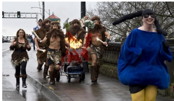
Figure 2: City as big playground: Portland Urban Iditarod Winner, Quest for Fire (2008).