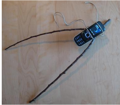
Figure 4: The idea of a contemporary rod, useful to perceive invisible signals.

Its survival through time and cultures and its easy identification make rhabdomancy a potentially powerful tool for contemporary urban game designer.