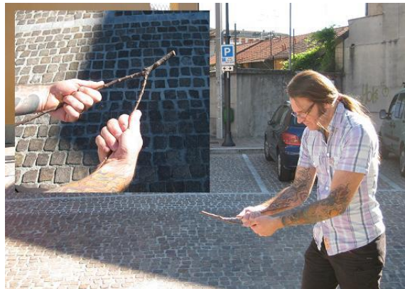
Figure 3: A contemporary rhabdomant, surfing the signal in an urban context through a traditional in rod apricot wood.

Its name is a composite word, deriving from two Greek terms: ράβδος ( rhábdos , the rod) and μαντεία ( mantéia , the act of divining): the rhabdomant focuses his attention on a tool, usually a rod, in order to look for something through a divining process.