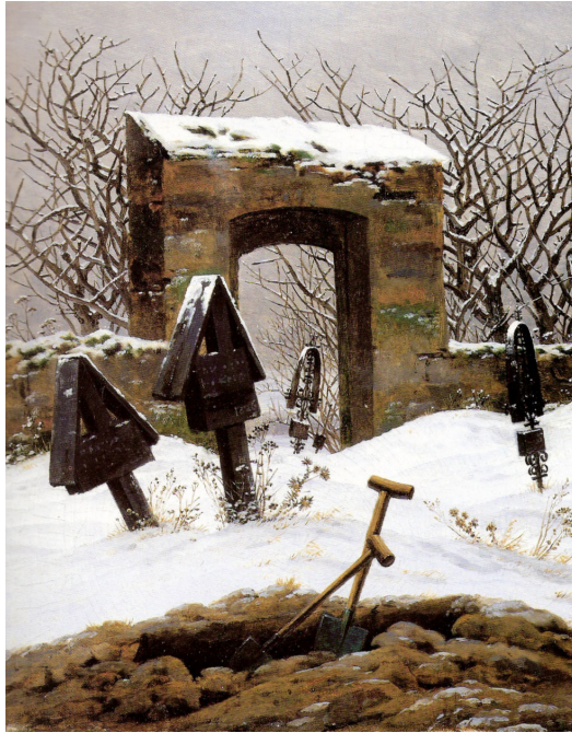
C. D. Friedrich, "Friedhof im Schnee", 1826/27

reference to Friedrich's dead family members. The single butterfly can be associated with Friedrich himself. 1