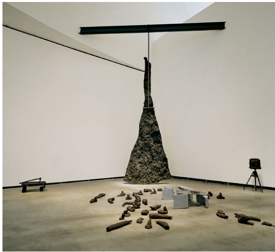
J. Beuys, “Blitzschlag mit Lichtschein auf Hirsch“, 1958/85

“Das Eismeer” has been compared with other paintings, including for example the 20 th century Joseph Beuys and his installation art “Blitzschlag mit Lichtschein auf Hirsch”. In form and content there are similarities. Beuys’ work was also innovative in his era and this artpiece has a relation to the Arctic. 1