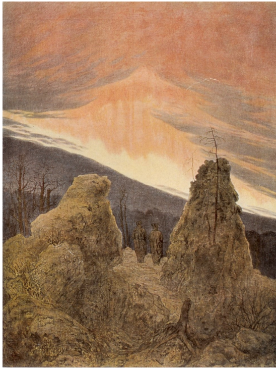
C. D. Friedrich, "Nordlicht", about 1834/35

The National Socialists also used polar phenomena, for example Friedrich's uncompleted painting "Northern Lights" in their propaganda. In the year 1834 in which Friedrich painted it, there was a political magazine, called "Northern light". The authors fought for the establishment of one German Nation and possibly Friedrich knew the author and the magazine. 1 In Friedrich's hometown there were phenomena of northern lights in the end of the 1820's and in the 1830's. Friedrich recognized them and he might have been inspired by them. 2