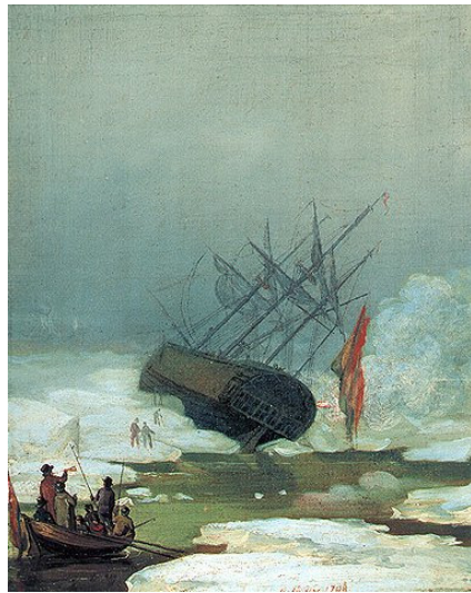
C. D. Friedrich (?), “Wrack im Eismeer“, 1798

Many of the reviewers were irritated because the composition of “Das Eismeer” was not traditional. For the viewer, there is no way to “enter the painting”. He or she is faced with huge ice floes. These are the main subjects of the painting, the shipwreck seems to be minor. This is different to other illustrations of these times