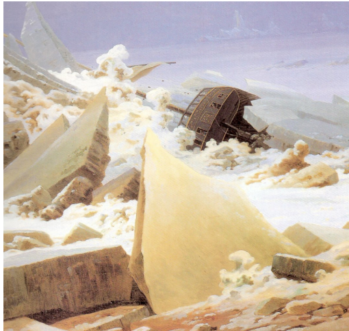
C. D. Friedrich, Detail "Das Eismeer", 1823/24