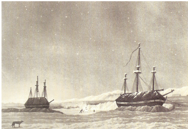
Engraved by William Westall after Frederick William Beechey, "His Majesty's Ships Hecla and Griper Blocked up with the Ice in Winter Harbour", 1820.