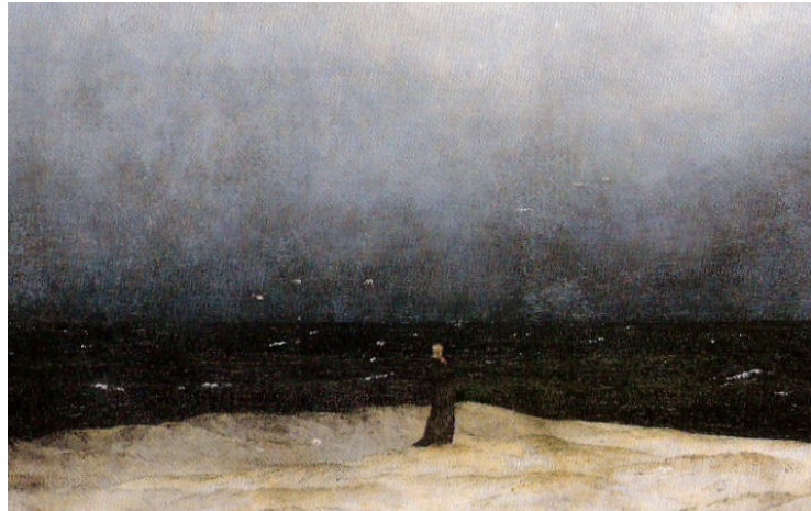
C. D. Friedrich, "Mönch am Meer", 1810

"Individuality" first gained significance in art, philosophy and literature of the 18th century. In Romanticism, the individual experience of nature became important.