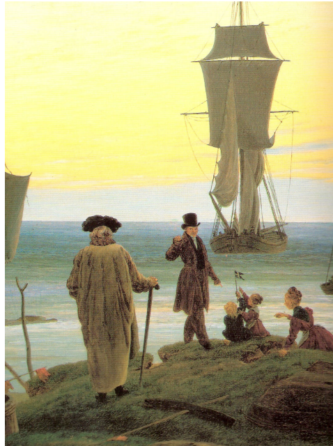
C. D. Friedrich, Detail, "Die Lebensstufen", 1835

There are many biographical links between Friedrich and the North. For example, Friedrich studied at the Academy of Copenhagen and later in Dresden where he met and became close friends with the Norwegian Romantic painter Johann Christian Clausen Dahl (1788-1857).