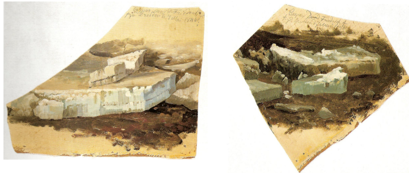
C.D. Friedrich, "Eisblöcke", 1820/21

The artist should paint not only what he sees before him, but also what he sees within him. If, however, he sees nothing within him, then he should also refrain from painting that which he sees before him. 2