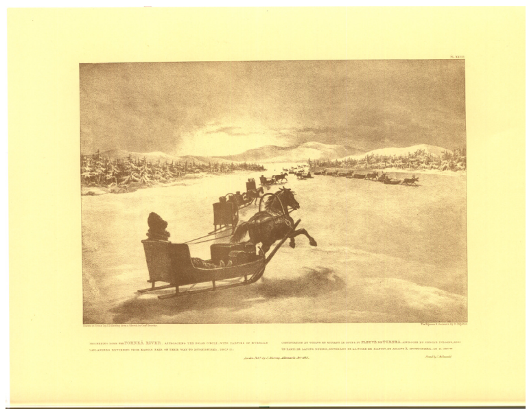
December 21th, "Proceeding down the Torneå River. Approaching the Polar circle, with parties of Russian Laplanders returning from Kangis fair on their way to Muonioniska."

Even though the landscape is present in all the illustrations it is seldom the primary topic. Instead, the landscapes serve as a setting for the travelling party and other aspects Capell Brooke wanted to highlight. In a way this function contradicts to the ideals of the Romantic era when Capell Brooke lived. During the Romantic period the landscape became one of the prime subjects in art as well as an important topic for theoretical discussions.<sup>1</sup> If one on the other hand compares the illustrations of the landscapes with the written travel book the illustrations give much more information than the text. It is obvious that the descriptions of the