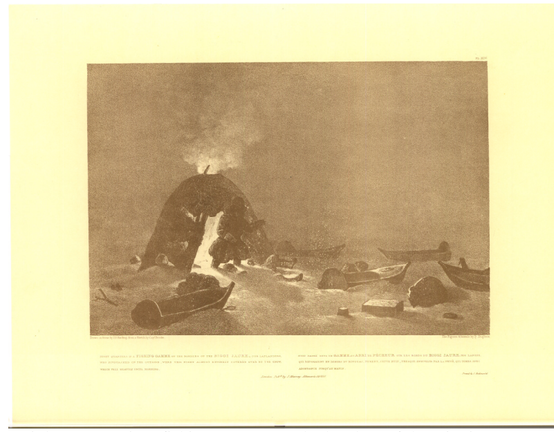
"Night quarters in a fishing gamme on the borders of the Biggi Jaure. Our Laplanders, who bivouacked on the outside, where this night almost entirely covered over by the snow, which fell heavely until morning"

There is a striking difference between the written travel book and the pictures when the Sami are concerned. One of the dominating themes relating to the Sami in the written text is alcohol. Capell Brooke states that they were heavy drinkers and had to be bribed with alcohol to continue the journey.<sup>1</sup> The obvious question is why there are such great differences between the media. One reason might be that it is harder to make a valid representation of the drinking problem in pictures than in text. A drinking Sami would not correspond to the pictorial decorum of the portfolio and would stand out from the rest of the pictures in a striking way. This means that those who only read the written travel book were informed about the Sami drinking problem, but for those who only saw the pictures, the Sami were the noble savages who aided the