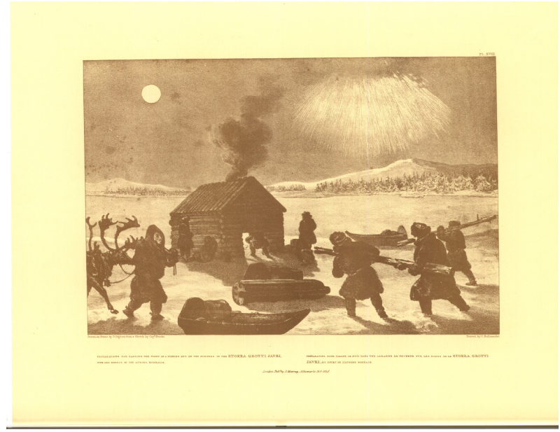
"Preparations for passing the night in a fishing hut on the borders of Storra Grotti Javri, with the effect of the Aurora Borealis."

Apart from the weather, the Aurora Borealis is present in the illustrations. The Aurora Borealis, and how it was seen, differs from the weather even though they are both natural phenomena. The main difference is that the weather is always there, even in the pictures that do not emphasise it, but the Northern lights are specific, so when they are depicted they become the primary subject. The Northern lights are present in three pictures.