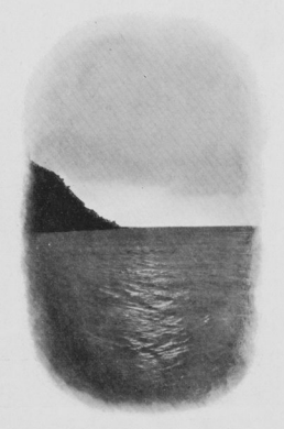
HORNVICH — CAPO NORD — ORE 2 DI NOTTE.

paesi, dolce saluto a tutti i pellegrini che vi giungono. Qualche bottiglia di champagne, del quale vi è larga provvista, rianima e rallegra i viaggiatori : si intrecciano i brindisi e si festeggia la nuova alba,