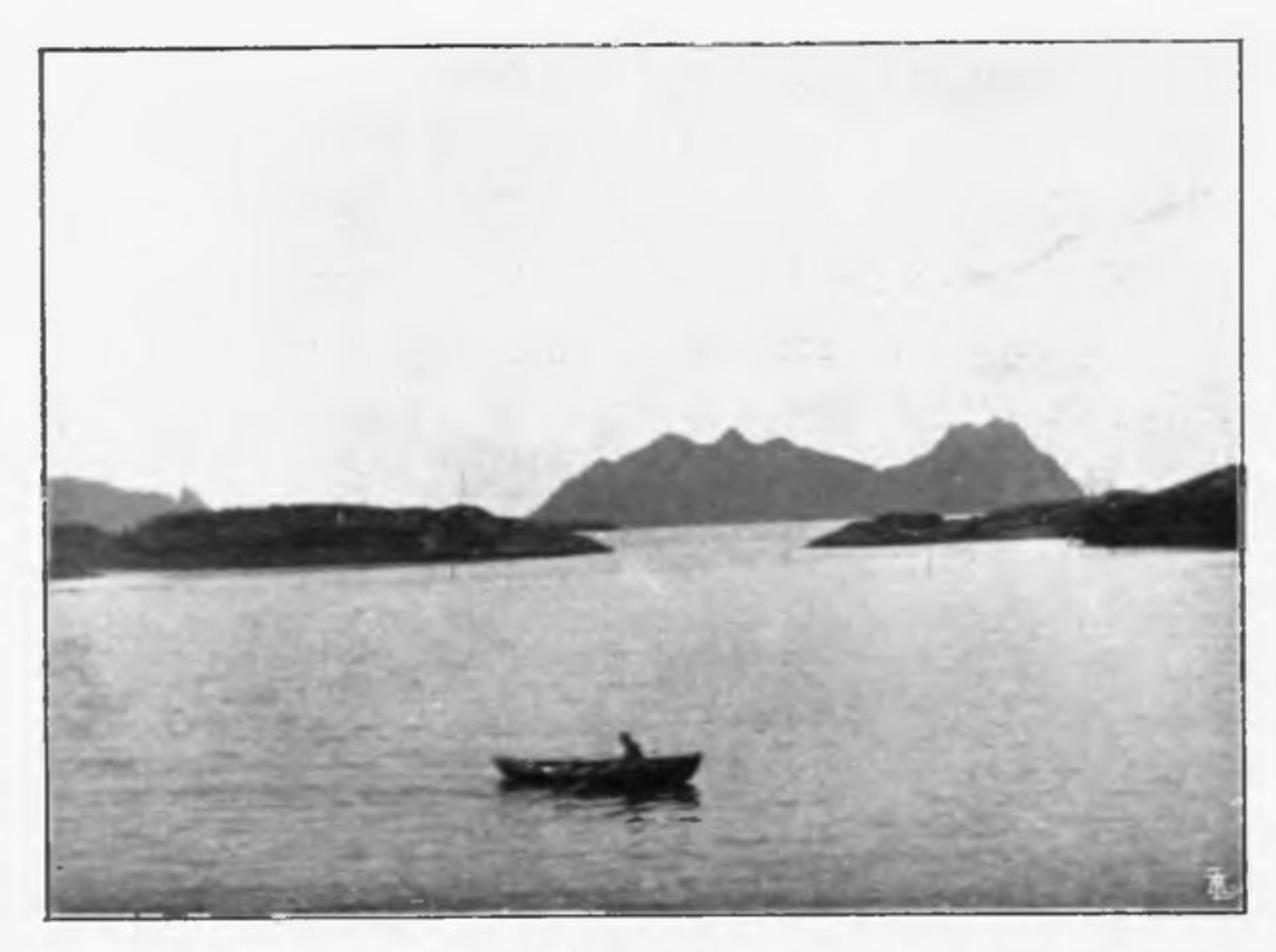
Le isole spettrali