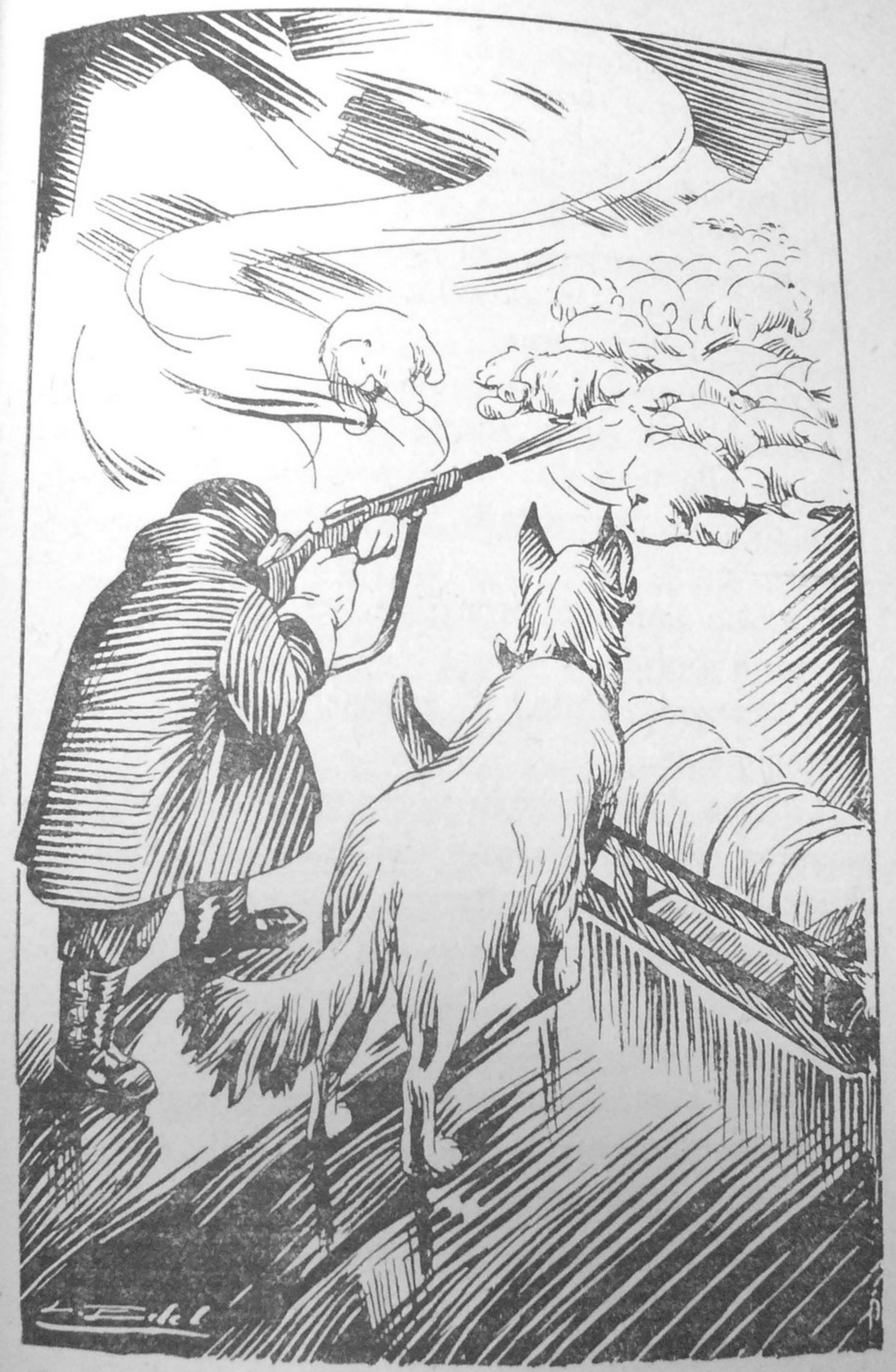
Ne uccisi una ventina.