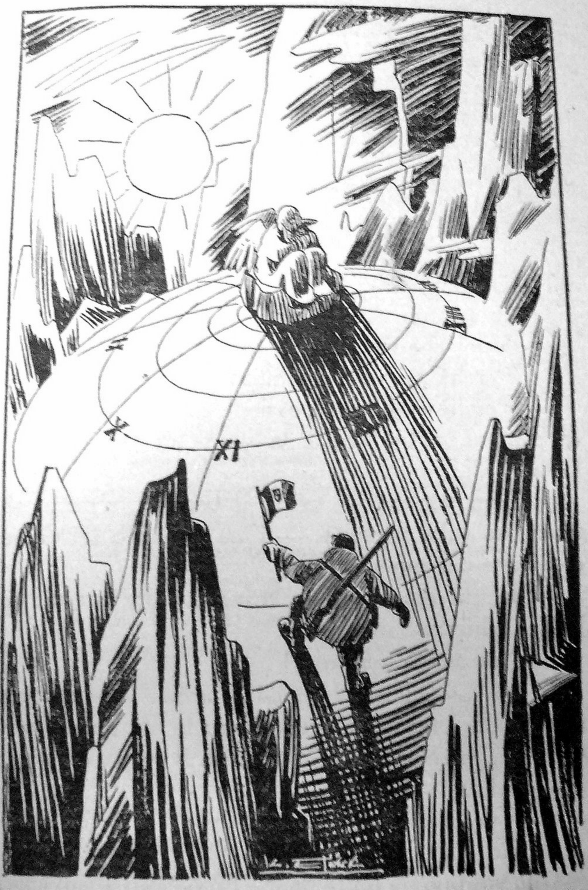
Lo avvicinai con l'aria del trionfatore...