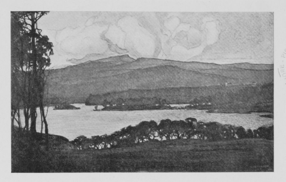
OTTO HESSELBOM - VEDUTA DEL LAGO

saputo fare in modo che non fosse interrotta la diretta e sincera derivazione della rappresentazione sulla tela dalla visione apparsa ai suoi occhi al cospetto del vero, aveva saputo mantenere l'equilibirio delle varie parti e dei graduali rapporti del quadro ed aveva saputo rendere il lavoro del pennello abbastanza rispondente ai bisogni specifici di una così complicata e difficoltosa opera rappresentativa, ella era riuscità eccellente.