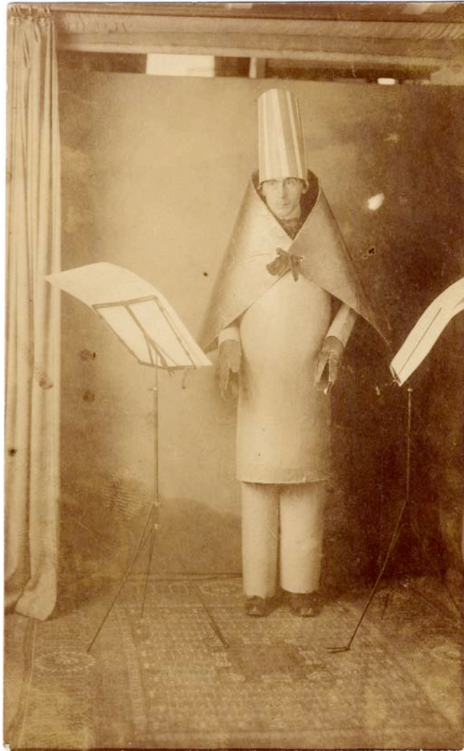
Illustration: Hugo Ball

The photograph of Hugo Ball, dressed in cardboard costume and conical hat, reciting the sound poem Karawane at a Cabaret Voltaire soirée, before being carried off stage in quasi-religious paroxysm, has achieved iconic status in the history of Dada. It is a—if not the —quintessential image of Zurich Dada. Ball's image, reproduced countless times, embodies and mythologizes the Dada cabaret and its innovation of sound poetry. It is scarcely surprising that the photograph is treasured, granting as it does a glimpse into Dada performances that have become infamous but remain irretrievable.