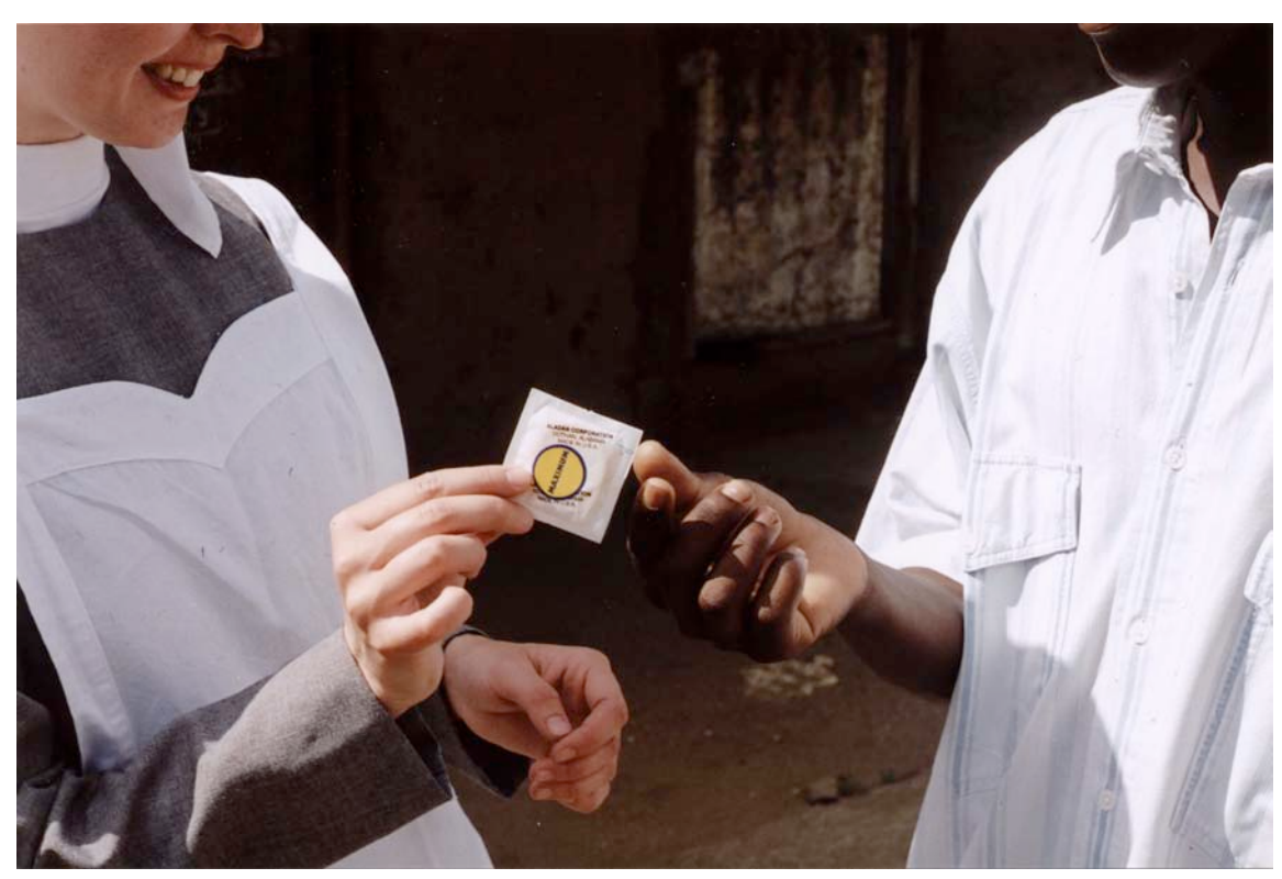
Illustration: Photograph from the work The Nun , Elina Saloranta 1997.

the "modern cynical eye of the artist". Saloranta's personal thoughts were, as I see it, connected with this new paradigm of artist charity and activity at the stage, when artists were only looking for the basis of community art.