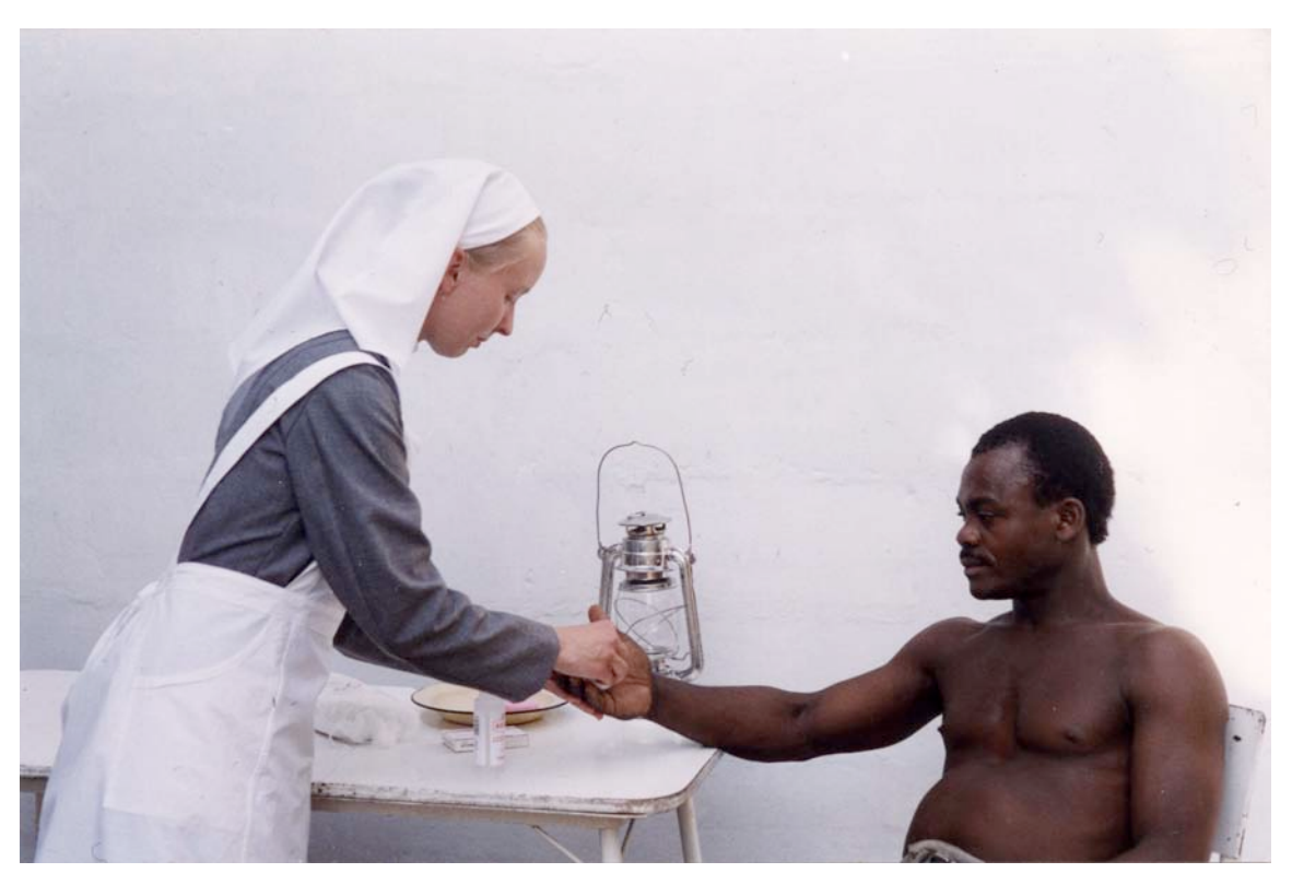
Illustration: Photograph from the work The Nun , Elina Saloranta1997.

In accordance with Suzanne Lacy's conception, the artist's position is separated from society. The artist has lacked function in society, a situation implicated into the social critic within the new works of public art.<sup>23</sup> According to Gablik, modernism turned the artist into a separated and emotionally distanced observer. Furthermore, she claims that the aesthetics of modernism was a cultural project producing objectifications, a project which taught the artist to canalise her perception according to abstract models and where the gaze forced her into the position of separated observer. <sup>24</sup> Thus the dialogical conception of art aims at a re-evaluation of the interaction between artist, artwork and spectator, and this re-estimation happens in relation to modernism.