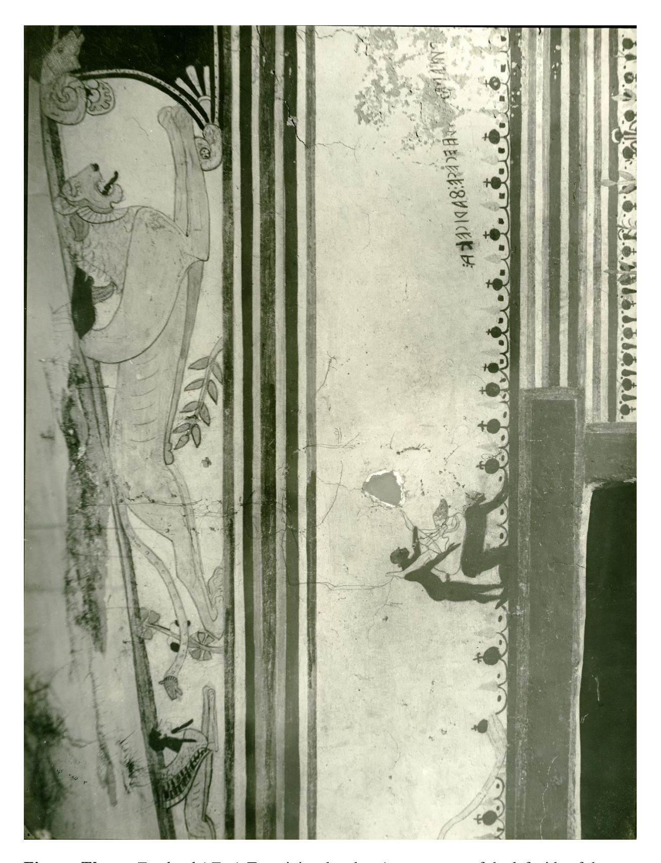
Figure Three Tomba dei Tori , Tarquinia; chamber A, upper part of the left side of the rear wall: erotic threesome group below, reclining sfinx and Chimera in the pediment above.