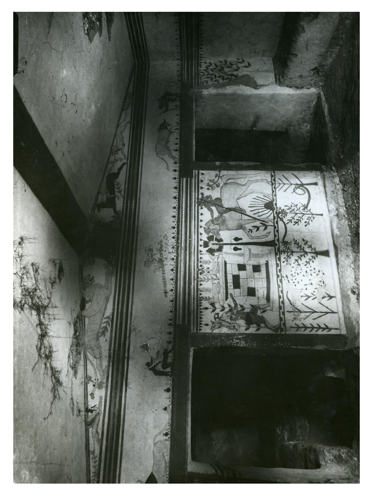
Figure One Tomba dei Tori , Tarquinia; chamber A, rear wall with the doors into respectively the chambers B (to the left) and C (to the right).