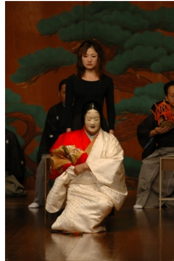
Double Nora , photo 2

Noh theatre was established as an artistic theatre form in the 14 th century, and has been regularly performed until today in a highly distinctive style. Many noh performers, both actors and musicians, are trained for a long time to acquire the ability to present fixed forms and patterns of acting in exact ways before they are permitted to perform as professional noh actors and musicians. Therefore, those noh actors and musicians in my production did not need a long rehearsal. They got together once or twice to decide which forms and patterns they would move or chant to. Of course the actors had to memorize their lines, but it was amazing how easily they got their lines into their heads. The music for Double Nora is also comprised of various patterns of notes taken from classical noh plays, which all the professional noh performers, both actors and musicians, are quite familiar with. So, the musicians were together only once before the opening night, and were able to play with actors as a perfect ensemble onstage.