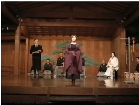
Double Nora , photo 1

6) Helmer says his last line, and disappears. Then, the musicians and the chorus go off the stage. No curtain call.