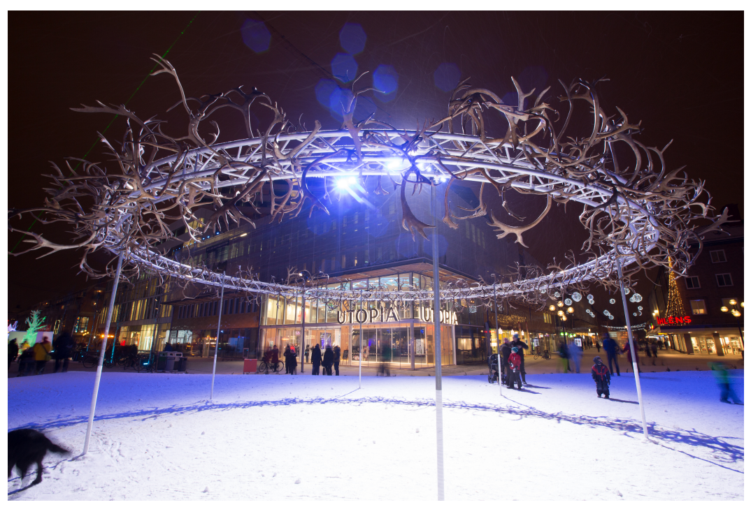
Fig. 2: Reindeer horns arranged to emphasise Sami culture and life-style in Umeå town square at the opening event of Umeå's year as European Capital of Culture 2014.

the local newspaper Västerbottens-Kuriren characterised the event as a PR-movie, staged for the outside and neither about Umeå nor intended for the locals (Burström 2014). A post-colonial point of view adds yet another layer of meaning, however, that loops back to and at least partly rehabilitates the exoticisation as a case of retrieval and an acknowledgement of a cultural, indigenous heritage that has been suppressed for centuries, as noted in another of the Swedish national newspapers, Svenska Dagbladet (Poellinger 2014). In both cases, the majority Umeå audience was alienated, but with politically opposite implications, as patronised by an outside gaze that integrates the modern population in a fundamentally pre-modern paradigm or as excluded by a new, celebratory indigenous culture.