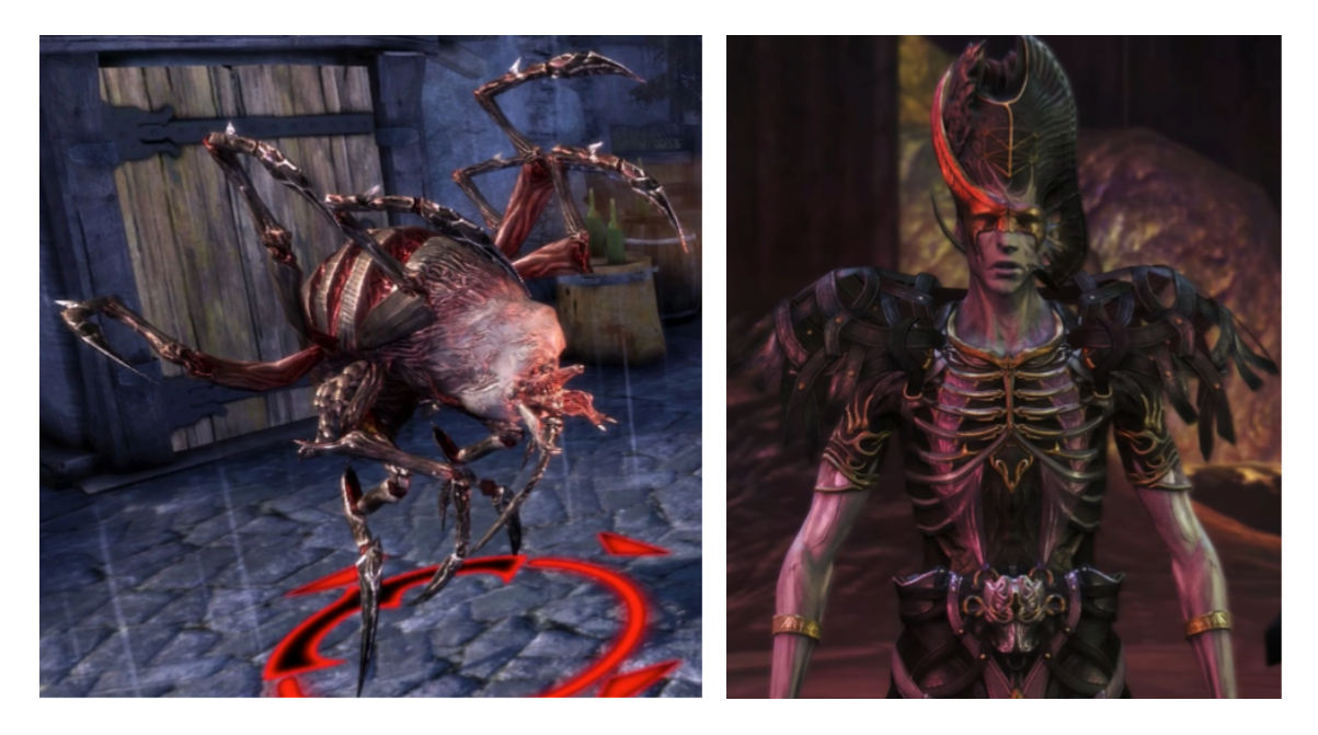
Figures 4a–4b. An Adult Childer ( Dragon Age: Origins—Awakening ; left) and The Architect ( Dragon Age: Origins—Awakening ; right).

By making her offspring even more repulsive, monstrous, non-humanoid, and abject, the game reinforces the message that she is worse than the Architect, and that she must be stopped before she covers the world in monstrosities that are loyal only to her.