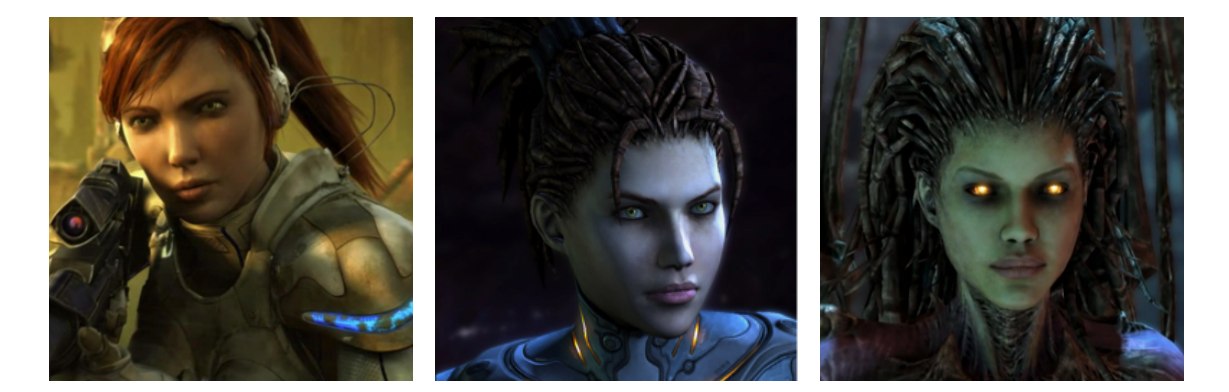
Figures 8a–8c. Kerrigan in her human, de-infested, and Queen of the Blades forms as portrayed in StarCraft II .