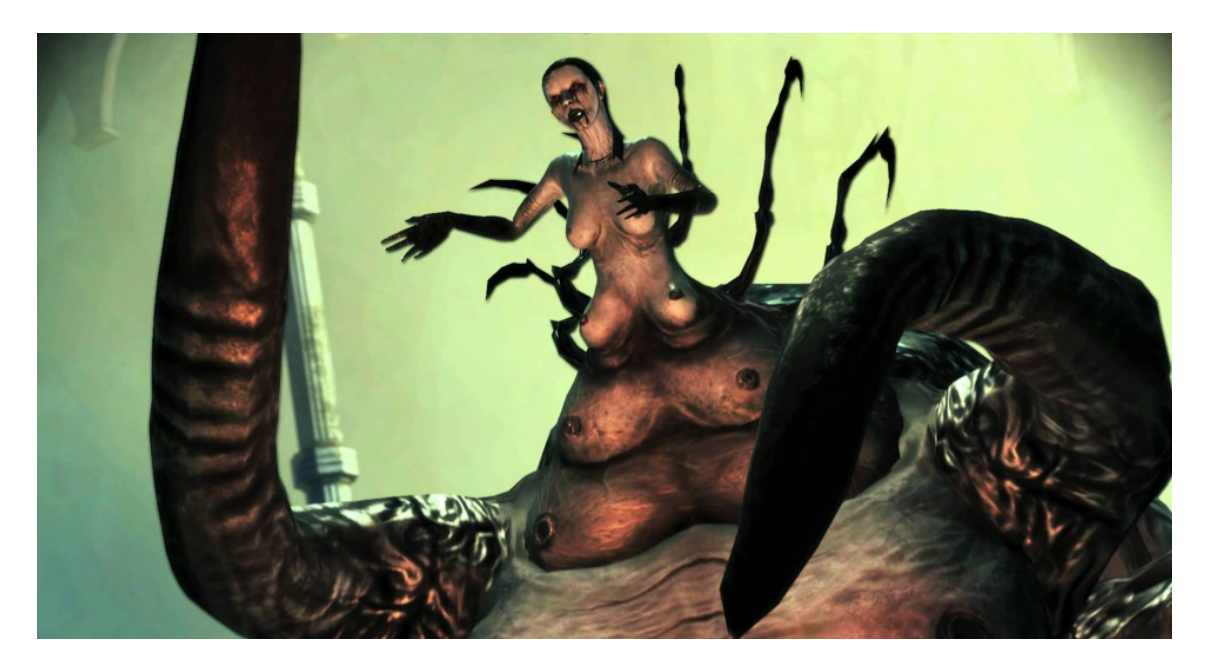
Figure 2. The Mother from Dragon Age: Origins—Awakening.