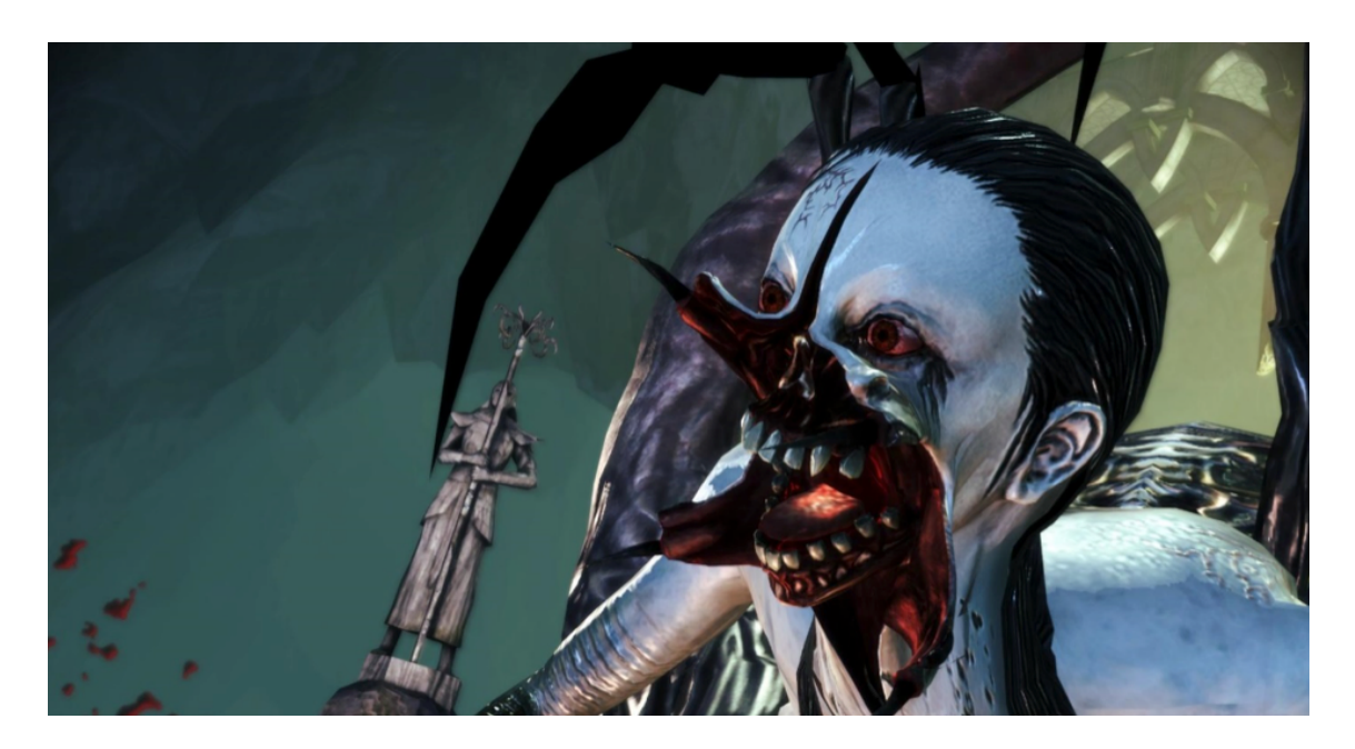
Figure 3. The Mother's Final Scream (Dragon Age: Origins—Awakening). Screenshot by the author.

In the game's narrative, the Mother's desires are contrasted with those of the Architect, a paternal, male Darkspawn who is also uniquely intelligent and self-aware. The Architect was responsible for granting sentience to the Mother. This caused her to remember who she once was and the fact that she was forced to devour her own family when she was mutated into a Broodmother, a realization that drove her mad. Her awakening also caused her to no longer hear the call of the Archdemon that normally controls the Darkspawn, and she blames the Architect for the loss of the Archdemon's 'sweet song'. The other sapient/awakened Darkspawn are torn between loyalty to the Architect, the reformer who wants them all to become sapient and self-sufficient, and the Mother, the traditionalist who wants them to return to mindlessly serving the Archdemon. Both characters control hordes of Darkspawn, but the Architect is presented as calm, logical, and wanting only peace for his 'children', whereas the Mother is portraved as mad, evil, emotionally unstable, and using her children as tools for her own desires. Although the Architect refers to the Darkspawn as his children, and the Mother even refers to him as 'the Father', he cannot reproduce. The Mother, on the other hand, gives birth to uniquely mutated Darkspawn called the Children who are protective, obedient, and loyal only to her.