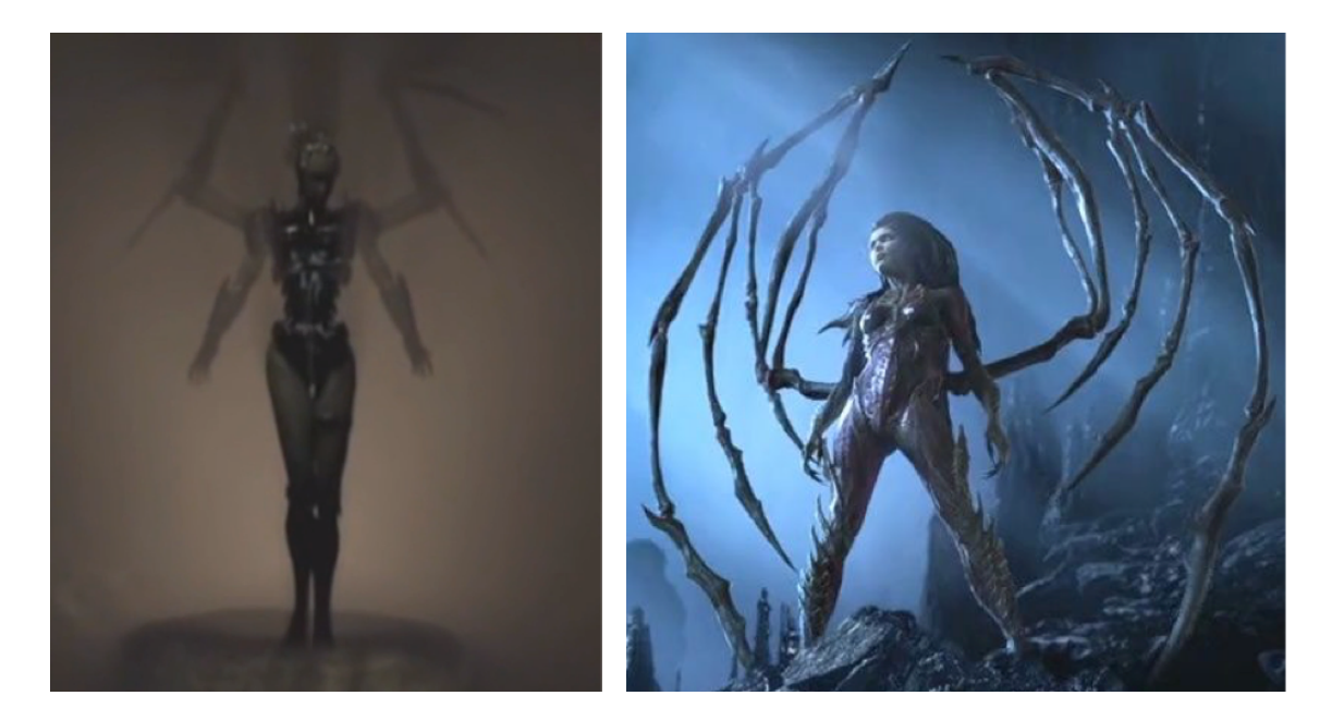
Figures 6a–6b. Kerrigan as the Queen of the Blades in StarCraft and StarCraft II cutscenes.

willing to brainwash, blackmail, and betray when it suits her purposes. She is completely self-aware and unapologetic, as exemplified by her observation that "at this point, I'm pretty much the Queen Bitch of the Universe" ( StarCraft: Brood War ) and her declaration that "every living thing in the universe will bow before the Queen of Blades, or else they will die" ( StarCraft: Frontline: Why We Fight ). Instead of being driven mad by her abject mutations, Kerrigan embraced them.