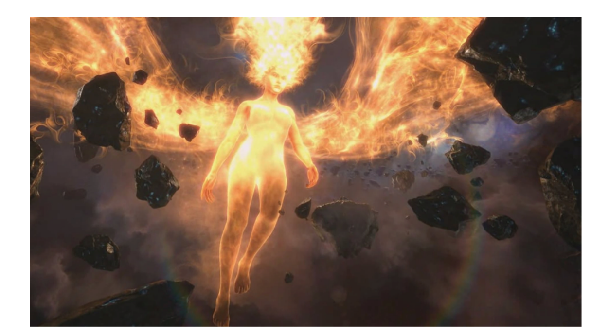
Figure 9. Kerrigan ascended as a Xel'naga (StarCraft II: Legacy of the Void).