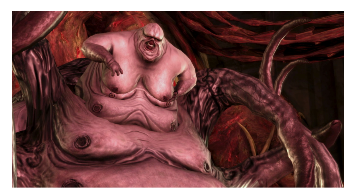
Figure 1. The Broodmother from Dragon Age: Origins.

monstrous versions of the gameworld's normal 'races': Humans, Elves, Dwarves, and Qunari, and in this scene, the player learns why. The Darkspawn breed by capturing women of these various races, force-feeding them poisonous Darkspawn blood, body parts, as well as flesh from people of their own race. This process kills most captives, but some survive the Darkspawn poison—called the Taint—and mutate into cannibalistic Darkspawn Broodmothers. Each race of Broodmother gives birth to a specific type of Darkspawn—a twisted manifestation of the monstrous mother herself, just as Creed described in her discussion of The Brood .