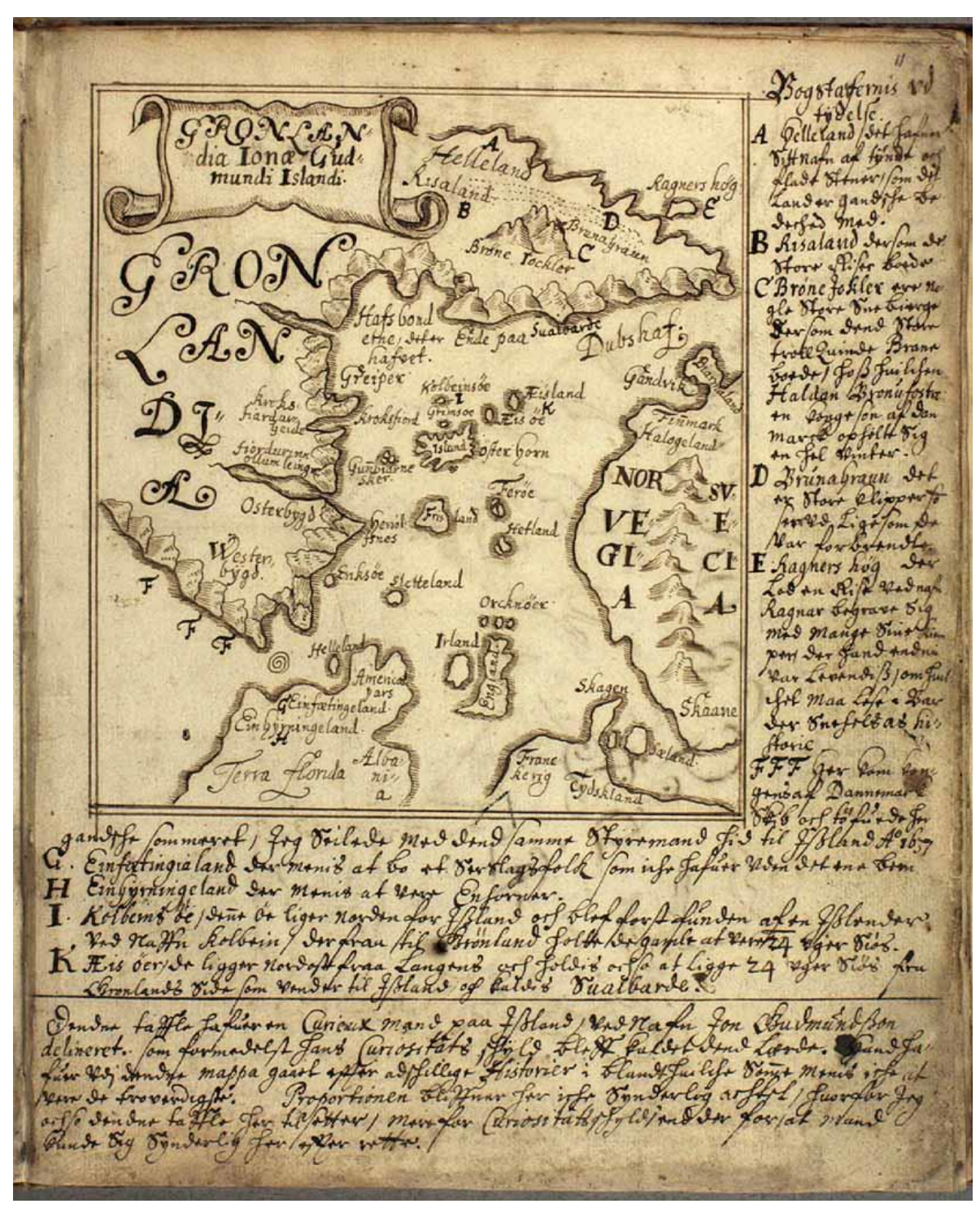
Fig. 1. Det kongelige Bibliotek, GKS 2881 4to, f. 11r.