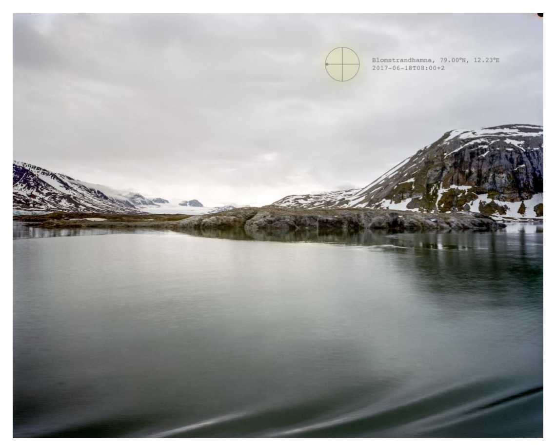
Fig. 13. Risa Horowitz, I set out to track the sun, 2018. Photograph on aluminium. © Risa Horowitz, <u>CC BY-NC-ND 4.0</u>

Risa Horowitz is a good example of art seen as activity, not product. She is associate professor at the Department of Visual Arts at the University of Regina in Saskatchewan, Canada. In her project, she set out to track the midnight sun, but nature (i.e. the weather) refused to play along. This changed the character of the entire project, forcing new solutions to what would have otherwise resulted in a seemingly common, although aesthetically very pleasing, display of the colourful beauty of Svalbard's nature. In the end, Horowitz's Svalbard undertaking resulted in a series of photographs where the position of the sun is anticipated and all the time lapse data are included, giving the images an air of scientific documentation, rather than being about the beauty of the place.