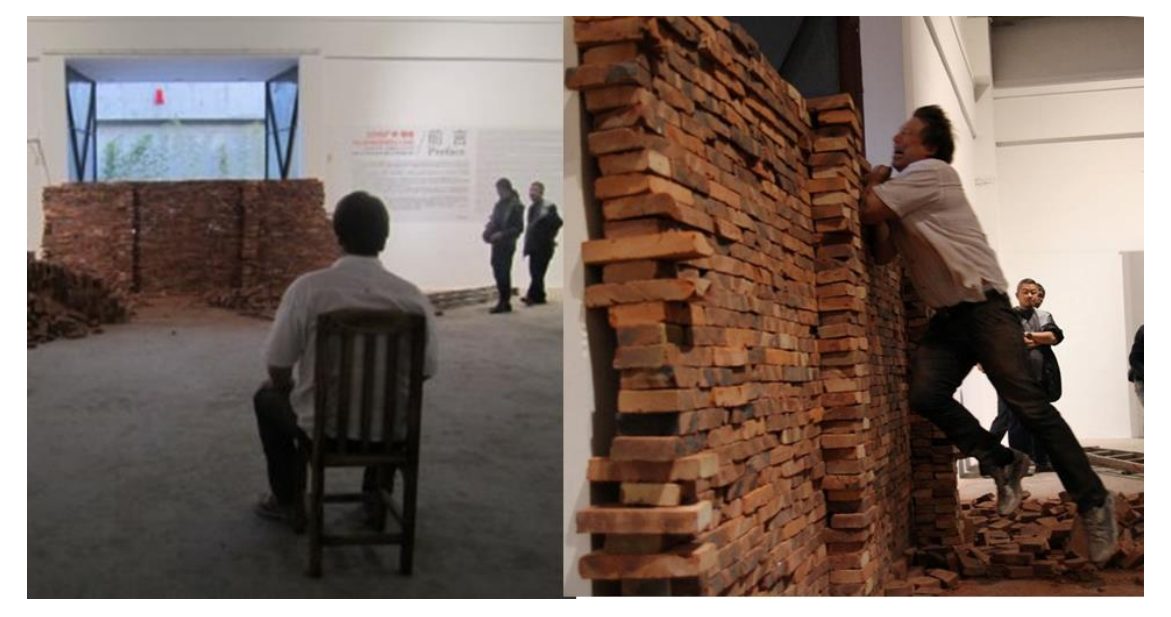
Fig. 8. Stein Henningsen, The Wall, PERF #1, Guangzhou Live, 2010. Photo: Ming Luo & Hongtao Zhang, <u>CC BY-NC-ND 4.0</u>

Henningsen is an artist with a very physical approach to art as a process . He crashes through a symbolic Chinese wall to open the performance art festival Guangzhou Live in China. As he discovered when working there, censorship of art expressions by Chinese authorities is not necessarily so harsh, unless you take the massacre of the Tiananmen square in 1989 and rub it in their faces. Unfortunately, the live footage is not available anymore where he starts running from fifteen yards away before hitting the wall. The symbolic meaning is obvious, though, and the stills speak clearly: one can see that opening new gateways of life and new modes of thinking – literally speaking – hurts.