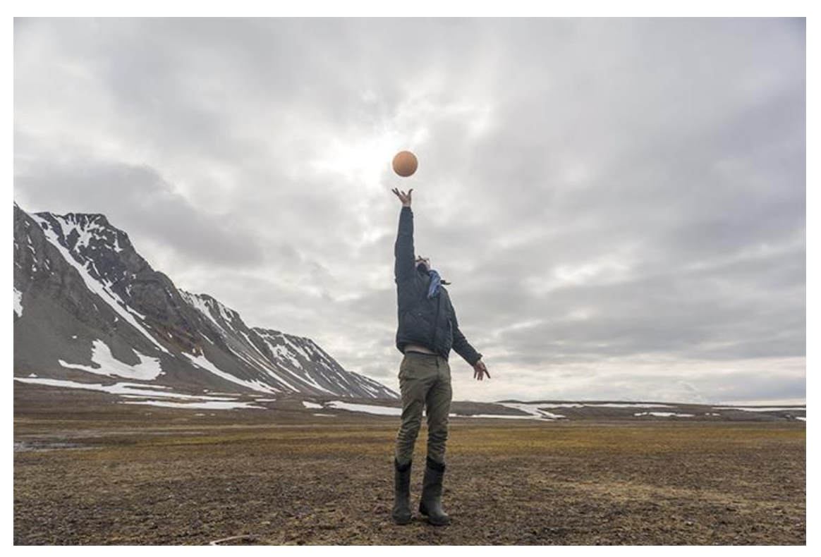
Fig. 14. Risa Horowitz: As if to track the sun, 2018. Photograph on aluminium.

The complementary series As If to Track the Sun imagines the sun's position in the round, with figure and buoy standing in for the otherwise persistently bright but hidden star. These two series were accompanied by a video compilation of imagery that Horowitz gathered – collectively entitled Practicing Standing – during the twenty-four hours that she spent in meditative action observing, and being within, the Longyear Valley.