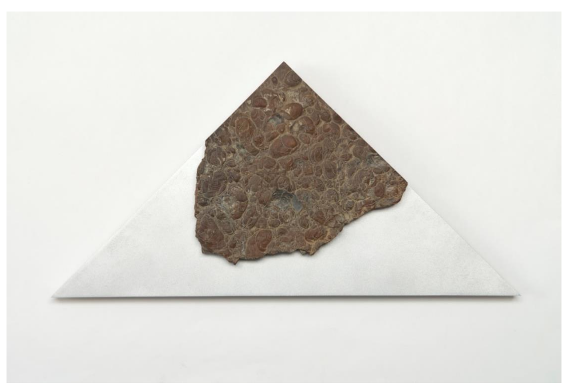
Fig. 5. Terje Roalkvam, Diviso I – XI, 2011. Aluminium and fossil sea mussels. © Terje Roalkvam, Photo: Jan Martin Berg, <u>CC BY-NC-ND 4.0</u>