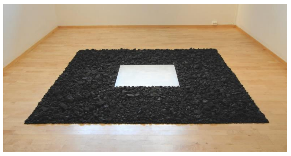
Fig. 6. Terje Roalkvam, Svea kvadrat, 2011. Floor installation in aluminium and coal. © Terje Roalkvam, Photo: Jan Martin Berg, <u>CC BY-NC-ND 4.0</u>

Common for many recent visiting artists working here is a concentrated focus on things like climatic changes, ecological issues and political debate. The Schnork Institute of Arctic Research, a project by the Norwegian artist Sigbjørn Bratlie (b. 1973), is a good example. It is simply a mock name of a non-existing agency. The institute has developed statistics, prognoses and various scenarios in relation to the Arctic environment and