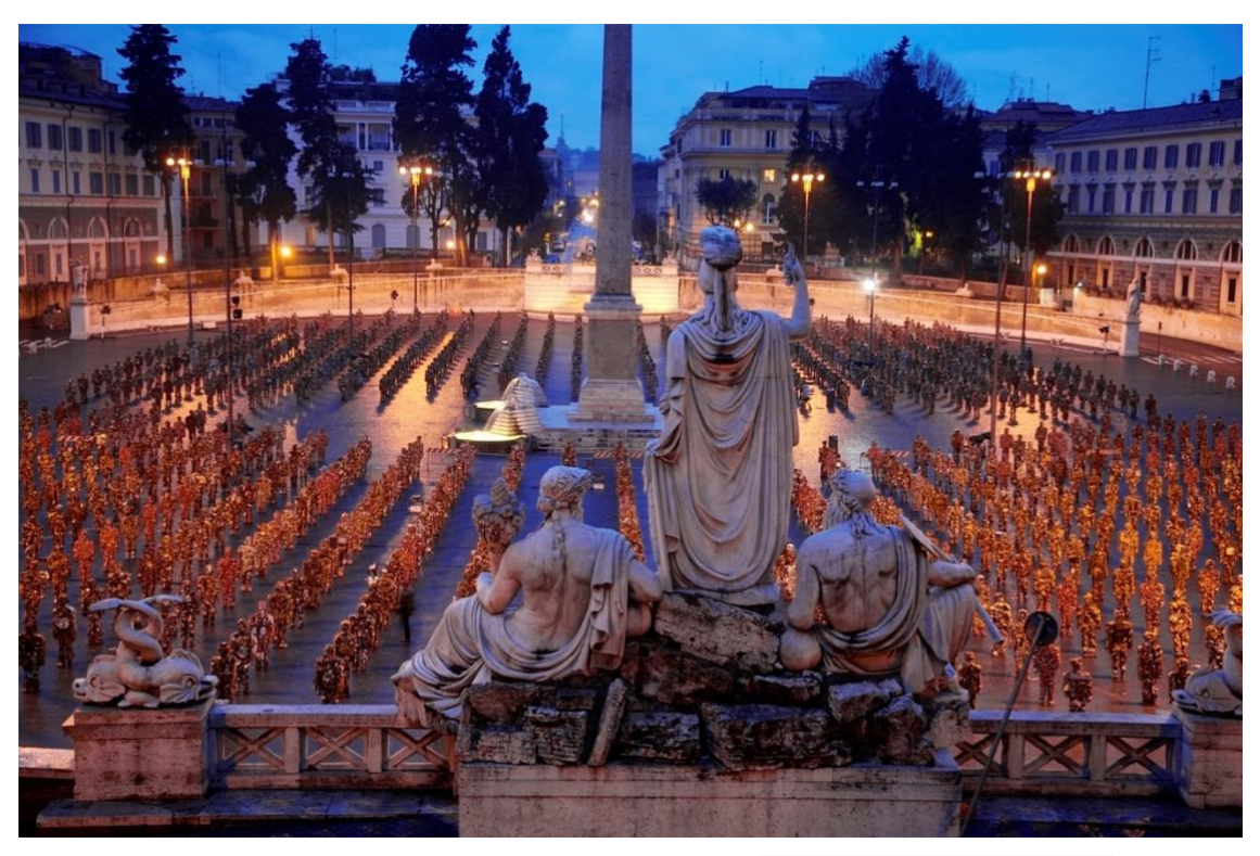
Fig. 4a. HA Schult, Trash people, Rome. © HA Schult, Photo: Thomas Hoepker, CC BY 3.0

Fortunately, he had luck with the weather, or we would have probably still been picking up the remains of his army all across the archipelago, adding a striking yet unintentional dimension to an art interpreter's options.