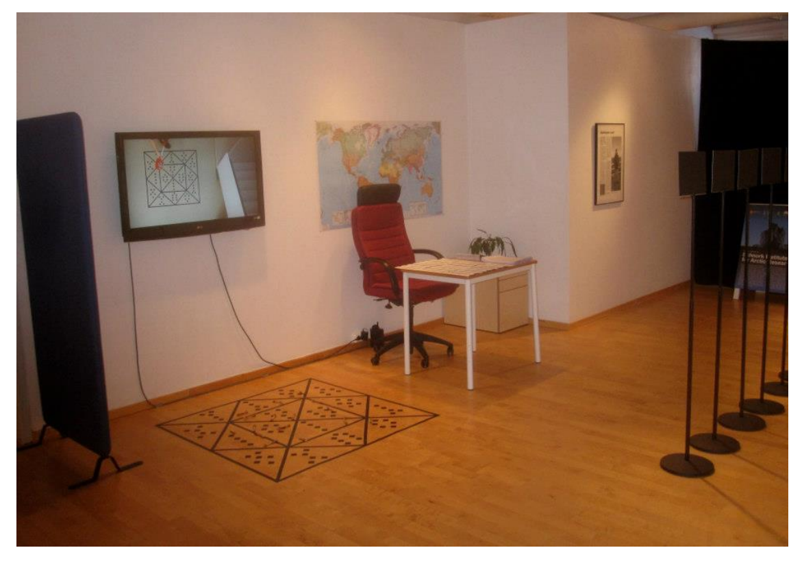
Fig. 7. Sigbjørn Bratlie, Schnork Institute for Arctic Research, 2013. © Sigbjørn Bratlie, <u>CC BY-NC-ND 4.0</u>

landscape. The institute has been plotting – not observations, but predictions of climatic changes in different places around the world. Predicted how? By the "science" of osteomancy – casting chicken bones on a soothsayer's diagram, and interpreting the results as predictions. Which – spoiler alert! – are of course not looking good for the future, as the artist himself bluntly put it. A tongue in cheek parentheses remark: the artist actually claimed greater accuracy than standard scientific climatic models, but the result was no less pessimistic than most of today's climatic research proper.