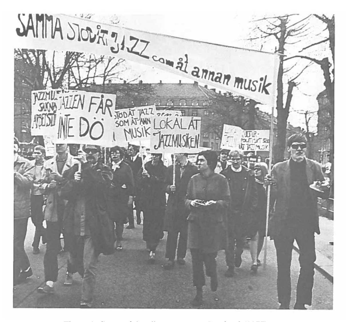
Figure 1. Cover of the album Music in Sweden 3 (1977)

One may trace such activism in the early days when jazz begun to creep into Scandinavian life, and for a moment the jazz craze became a threat to local musicians' employment. The Danish Musicians' Union, for example, strived to ensure employment for its members: in 1927 they created a rule stating that foreign orchestras and musicians could not work without hiring a corresponding number of local Danish musicians (Brown et al. 2014, 60). Like elsewhere in the world, such policies allowed visiting U.S. jazz artists to meet local musicians and engage in mutually beneficial collaborations, which allowed local musicians to play with more experienced players and maverick young musicians to test their craft against the jazz elite. Among the countless examples, bassist Nils-Henning Ørsted Pedersen is perhaps one of the most celebrated. Pedersen's regular work at Café Montmartre in Copenhagen led to a lifetime of collaboration with pianist Oscar Peterson. The booking policy at Café Montmartre drew from the Musicians' Union's 1927 policy, ensuring that the entourage of visiting musicians, 'jazz greats', was made up of local Danish players. Such cross-cultural exchanges also had a profound impact on international jazz musical production. To give