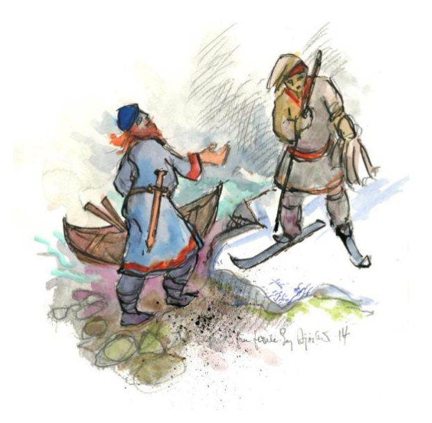
Figure 5. 'Sámi man presenting Norse man with vair' (Bjørklund 2014, 1).