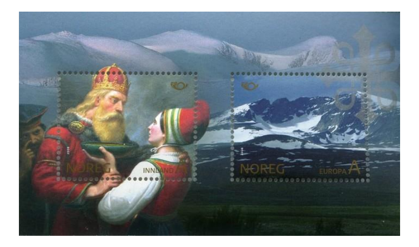
Figure 4. Norwegian stamp design based on a painting from the farm Tofte, Dovre. The stamp depicts the first meeting between spouses King Haraldr hárfagri and the Sámi woman Snæfríðr in Dovre, with her father Svási finnakonungs (king of the Sámi) in the background (Hermanstrand 2018).