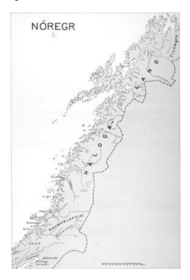
Figure 2. Northern Norway as imagined in Egils saga Skallagrímssonar (Nordal 1955, n.p.). Notice how the cartographer has neglected to depict the saga voice.

Some archaeologists even suggest that certain multicultural and fluid societies based on an amalgamation of Sámi and Norse cultural groups cooperating in the same area can be seen in the archaeological material (Bergstøl 2008, Zachrisson et al. 1997). This would certainly support the idea of smoother cultural boundaries between the groups in the early medieval period than suggested by Saxo and Adam of Bremen, potentially providing a new outlook on the characters in later textual sources with nicknames such as hálftrolls and hálfbergrísi.