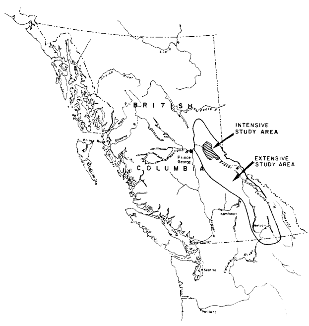
Figure 1. Location of the intensive and extensive study areas of the MCMF Program.

cur in the intensive study area, the mountain and plateau types, also dominate other caribou ranges in southeastern British Columbia (the extensive study area» in Figure 1). Of the two broad configurations of biogeoclimatic zones, the ESSF-ICH complex is typical of most of the extensive study area. Management strategies developed in the intensive study area apply, with some modifications, to caribou ranges throughout the extensive study area. MCMF is involved in several cooperative projects in the extensive study area.