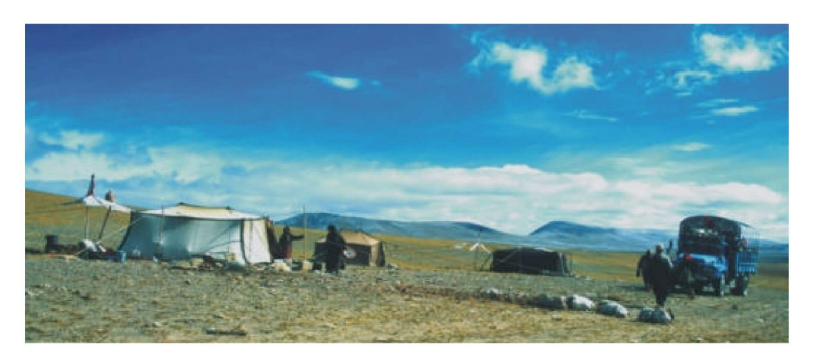
Fig. 3. Nomad camp in the Aru basin, with a recently purchased truck used for moving camp and transportating wool to market.