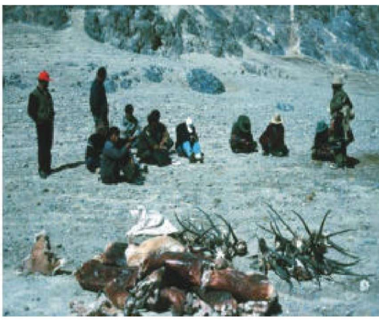
Fig. 5. Confiscation of antelope traps from a nomad (left) and chiru pelts and horns confiscated from traders (right) who bought them from nomads, both just SE of the Aru basin.