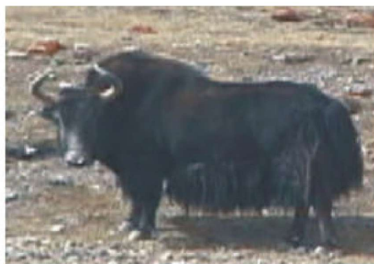
Fig. 2. Chiru (Tibetan antelope) and wild vak in the Aru basin.

Some 30 000 nomadic pastoralists depend on rangelands within the reserve for livestock grazing, and those in areas with significant wildlife density have traditionally depended in part on hunting for supplementary subsistence and trade (in part for shahtoosh). With rapid changes in wildlife markets, government subsidised modernisation pastoralism, and concerns over preserving Tibet's wildlife populations, the establishment of the nature preserve has brought into sharp focus conflicting aspects of these various factors. The TAR's 1997 request for assistance focussed on development aid associated with the creation of the reserve; our project aims to provide baseline information upon which management of wildlife and livestock can be developed to ensure the continued presence of threatened wildlife as well as a better standard of living for nomads in the reserve.