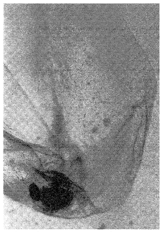
Fig. 1. Roe deer blasrocysr starting to elongate 5 January 1998. Size: 1.5 mm x 1.05 mm. The length of the short side of the photo is 0.95 mm.

elongation (Fig. 3A), but qualitative differences were evident after implantation (Fig. 3B). The majority of radiolabelled endometrial proteins secreted during diapause and early elongation had isoelectric points (pI) between 5.9 and 7.2. After implantation, there was a shift towards higher molecular weight basic proteins. These changes were consistent over the three-year period. Visual examination of gels produced from the uterine luminal flushings showed a consistent profile during diapause and the early stages of elongation.