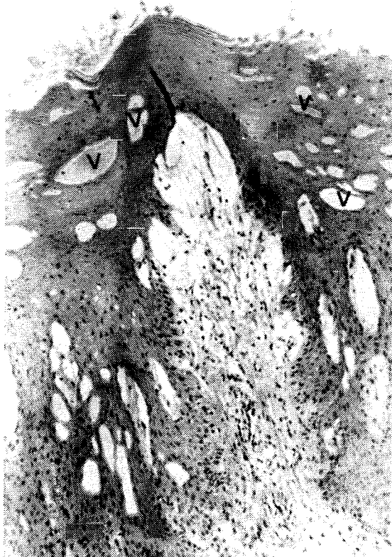
Fig. 1. Tongue of reindeer. Note numerous vesicles (V) and oedema HEx70

The possibility of a primary virus infection, as indicated in this paper, may explain the rapid spread of mouth lesions in herds of reindeer as reported by Horne (1897), Nordkvist (1966) and Skjenneberg and Slagsvold (1968) and observed in this investigation. Attempts to isolate a virus have, however, not yet been performed.