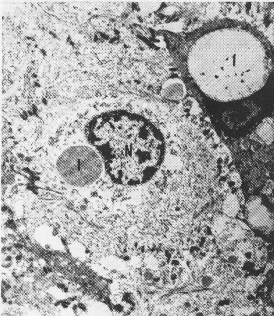
Fig. 4. Electron micrograph of epithelial cells from tongue of reindeer. Note inclusion bodies (I) and compressed nuclei (N) x6000