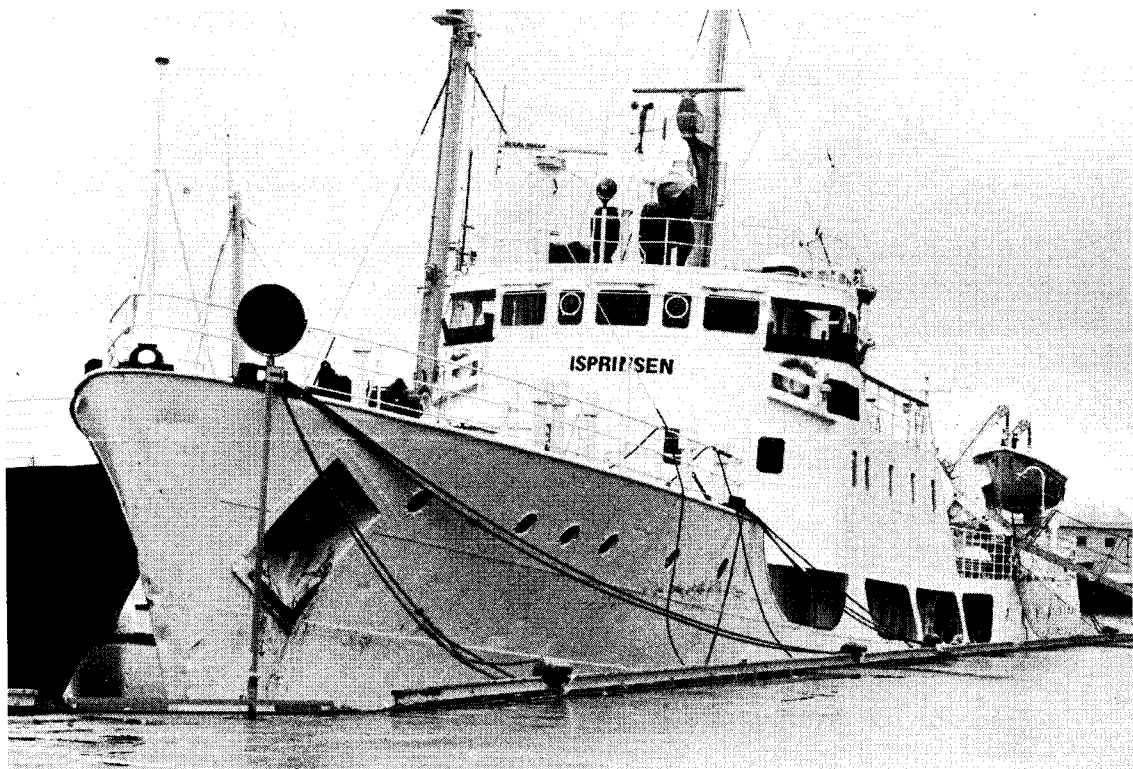
The hotel-ship «Isprinsen», Tromsø.