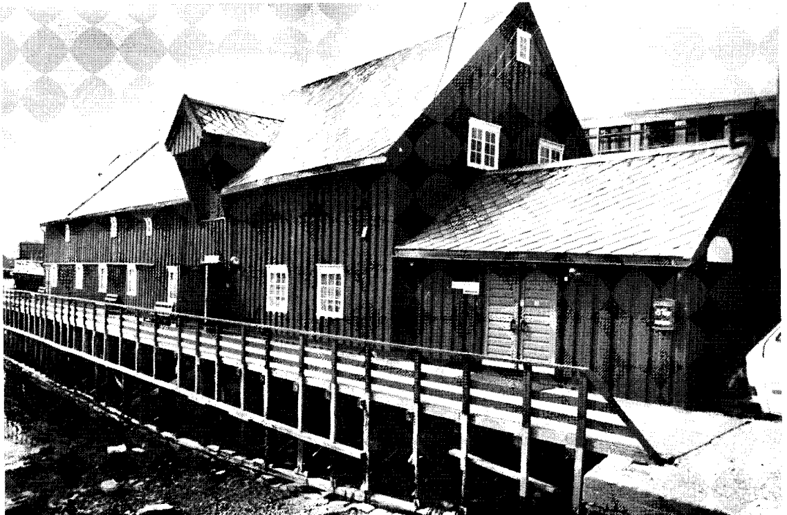
The Polar Museum, Tromsø, Norway.

Gustaf Åhman Department of Reindeer Research Swedish University of Agricultural Sciences S-750 07 Uppsala